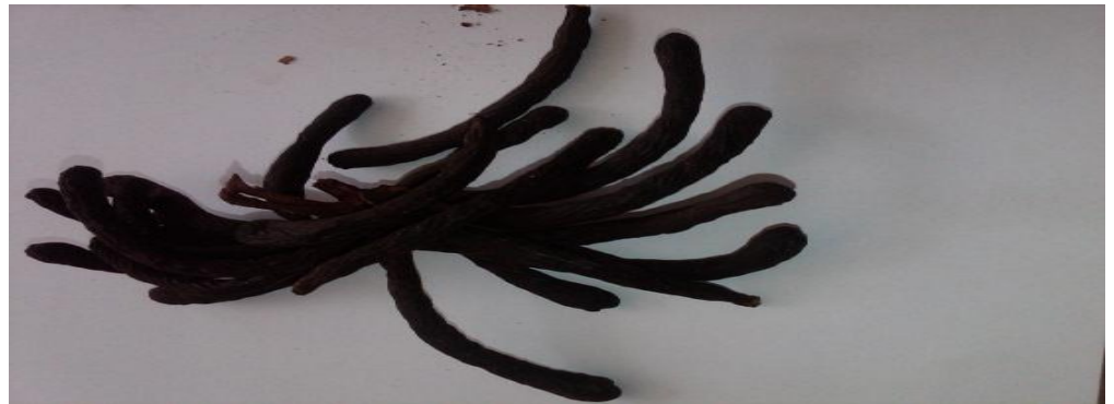
Plate 3: Xylopia aethiopica