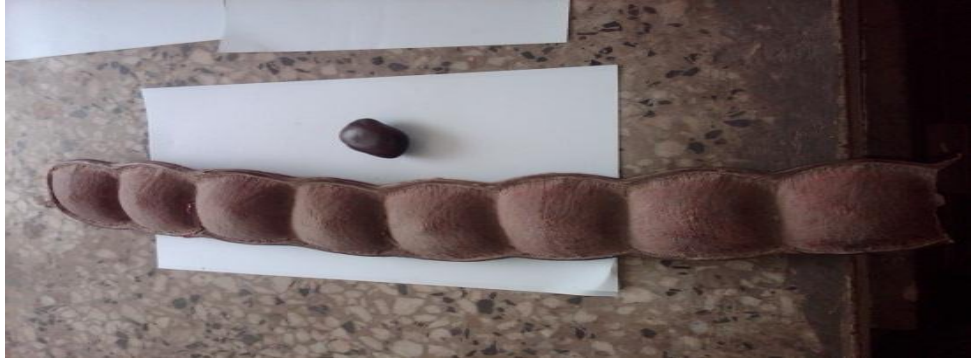
Plate 5: Etanda gigas