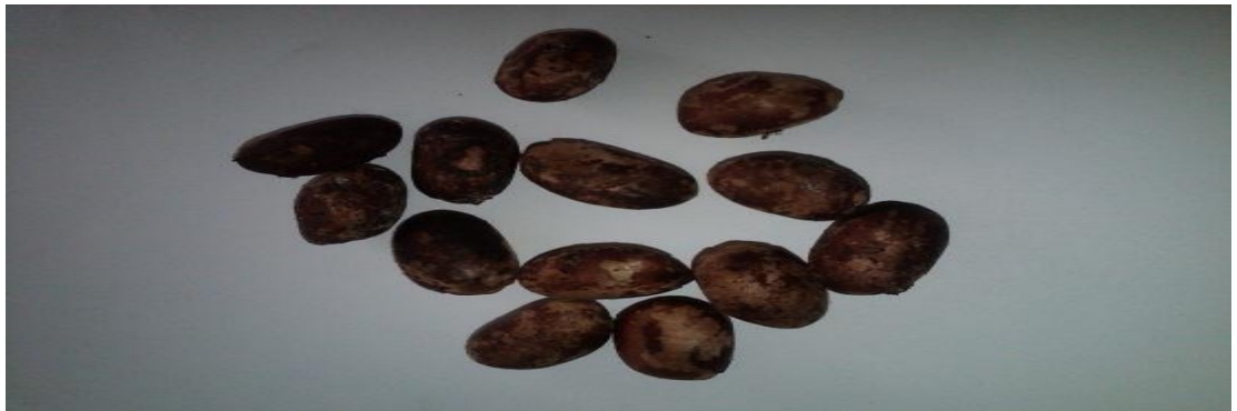
Plate 1: Monodora myristica