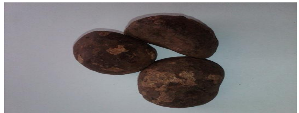
Plate 4: Buchholzia coriacea (Wonderful cola)