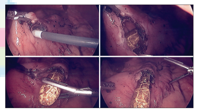
Figure 2: Intraoperative image: Creation of gastrotomy with visualisation, instrumentation and subsequent mobilisation of retained toothbrush