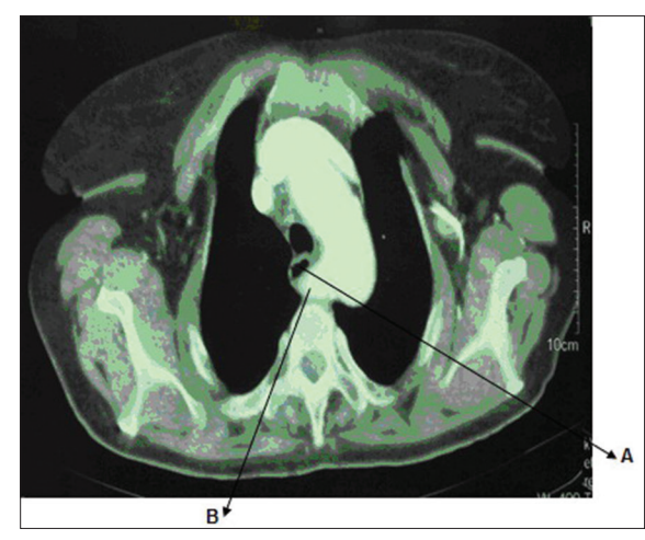
Figure 1: Computed tomography scan of aberrant right subclavian artery (B) posterior to esophagus (A)

However in patients who are candidate for upper mediastinal interventions such as esophagectomy (especially the transhiatal esophagectomy), even the asymptomatic cases of this arterial anomaly become challenging.