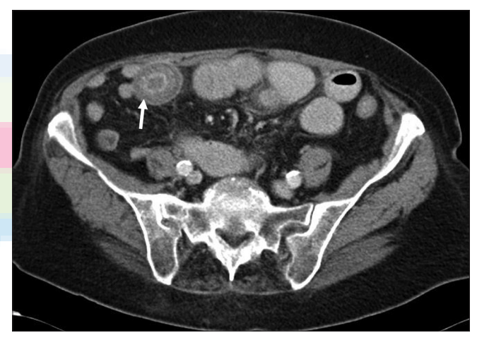
Figure 4: Axial CT image of the pelvis: There is a calculus (white arrow) identified within the small bowel lumen. Note the presence of both dilated and non-dilated small bowel

CT - Computed tomography; ND - Not documented