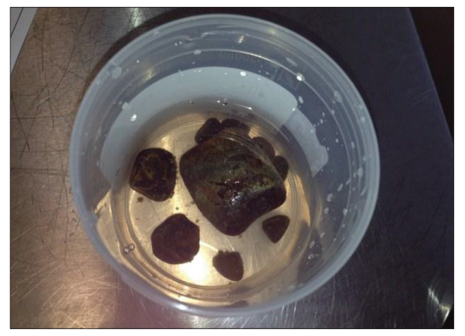
Figure 5: Numerous gallstones retrieved from small bowel lumen

shown that pneumobilia can be detected up to 89% of all cases of gallstone ileus. [9] In the past, the diagnosis was often made during laparotomy. [10] Plain abdominal radiography and ultrasound are helpful in diagnosing gallstone ileus but the sensitivity of both modalities is low. CT scan is the investigation of choice for evaluating gallstone ileus as it has high sensitivity (93%) and specificity (100%). A CT scan can accurately measure the size of the gallstone and establish the anatomical site and the nature of the obstruction. Comparison between specificity and sensitivity of each modality is shown in Table 1. Therefore, CT scan is usually a preferred diagnostic modality because of its high