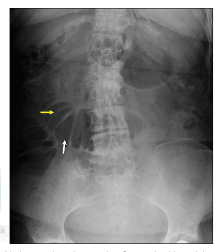
Figure 2: Abdominal radiograph: Central, dilated loops of small bowel (white arrow). Note the plicae circulares or valvulae conniventes (yellow arrow), a feature of small bowel, which confirms that the dilated structure is small bowel. Some loops measure 64 mm in diameter. There is no gas within the large bowel suggesting a complete or nearly complete mechanical small bowel obstruction

intra-luminal faceted gallstones. An abdominal washout was performed using warm saline in order to prevent gross peritoneal contamination. The abdominal incision was closed by a mass closure technique using an absorbable loop Maxon<sup>TM</sup> suture and staples to the skin. The fistula was left undisturbed and the patient made an uneventful recovery.