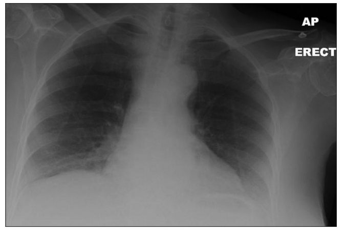
Figure 1: An erect chest radiograph: No evidence of air beneath the diaphragm

After initial fluid resuscitation with 0.9% sodium chloride, correction of electrolyte imbalance, and nasogastric decompression, the patient underwent midline laparotomy. A proximal longitudinal enterotomy was performed. Numerous small bowel stones [Figure 5] of variable size were "milked" distally. The largest stone measured 3.5 cm in diameter was retrieved from the small bowel lumen [Figure 6]. Each section of the bowels was inspected in a segmental fashion for sign of ischemia and other