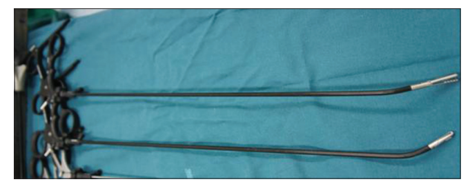
Figure 2: Rigid prebent atraumatic grasping forceps

The surgical instruments used during the surgery were X-cone single port system [Figure 1], a rigid 30°, 5-mm diameter, 45-cm long laparoscope in combination with, a rigid prebent atraumatic grasping forceps, a straight Reddick grasping forceps [Figure 2] and a standard straight Robi Kelly bipolar. X-cone single port system is a reusable,