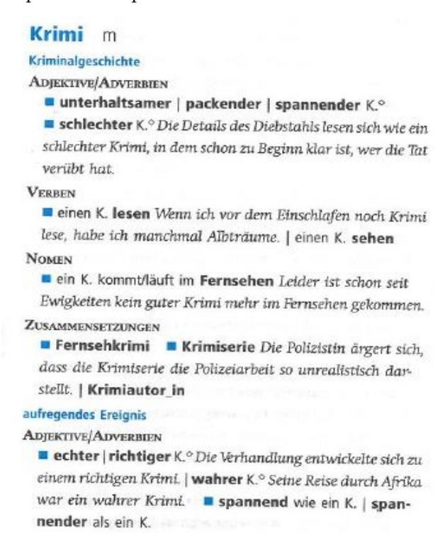
Example 8 from Feste Wortverbindungen des Deutschen

The following discussion only focuses on the presentation of collocations in general language dictionaries. A different approach would be employed in a dictionary of collocations. Lexicographers of general language dictionaries should pay attention to the way in which dictionaries of collocations present and treat their collocations because some of these features could also be introduced in general language dictionaries. The following article for the lemma sign Krimi (= crime story/film) from Feste Wortverbindungen des Deutschen (Häcki Buhofer et al. 2014), a German collocation dictionary, illustrates the occurrence of the word Krimi in different collocations, arranged in the article firstly according to the different senses of the word, given in subsequent subcomments on semantics, and within each one of these subcomments on semantics according to the part of speech of the partner word: