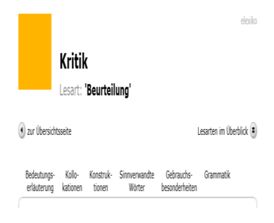
Example 3 from elexiko

The elexiko dictionary, as seen in the following two screenshots from the article of the lemma sign Kritik (= criticism), gives users the opportunity to click on the button "Kollokationen" (= collocations). They are then directed to a list of cotext partners: