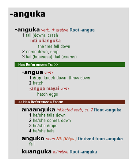
Figure 3: Dictionary entry for anguka in TeDJe-SED

The dictionary was created using TshwaneDJe's in-house lexicography tool TshwaneLex (Joffe et al. 2009). It can be accessed on-line through a web interface and is available as a stand-alone download as well. The actual source files can only be accessed through TshwaneLex . Even though it features a fairly limited number of lemmas, it provides by far the most detailed lexicographic information of all the dictionaries in this survey, as illustrated in Figure 3.