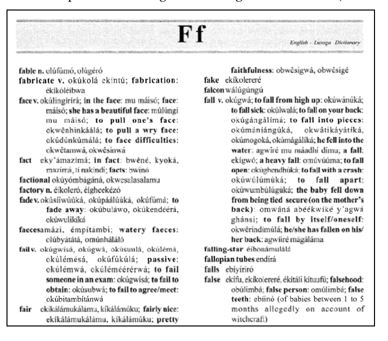
Addendum 4: Sample from the front matter in the WSG (Nabirye 2009: 616) [Note that the front matter was translated into English and included as a back-matter text in the WSG. The section shown here was taken from the back matter.]