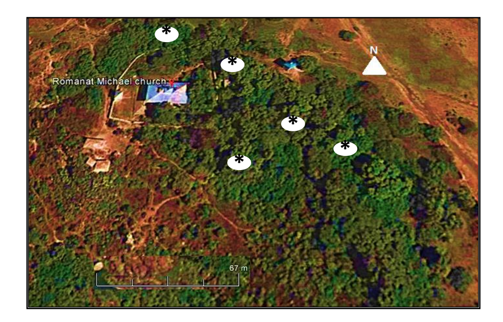
Figure 2. Aerial photo of Romanat Michael church forest (top). The five white circles with asterisks in the bottom figure show the points where the hyraxes congregate for feeding, basking and nesting. (Figure reproduced from Google Earth 2014).