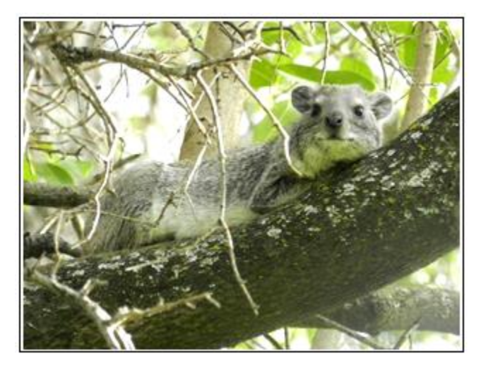
Figure 1. Photo of a bush hyrax ( H. brucei ) taken from Romanat Michael church forest on May 2012.

The hyrax is a medium-sized ( c . 3.6 kg average adult weight), herbivorous mammal with short legs, a rudimentary tail, and round ears (Nowak, 1999; Barry and Hoeck, 2013) (see Fig 1). They belong to the order Hyracoidea, and family Procaviidae, which is the only living family of the order. The family Procaviidae is composed of three living genera, rock hyrax ( Procavia ), tree hyrax ( Dendrohyrax ) and bush hyrax or yellow-spotted hyrax ( Heterohyrax ). The genus Heterohyrax contains only one living species, H. brucei (Fig 1) (Barry and Shoshani, 2000). Within H. brucei , there are about 25 recognized subspecies (Barry and Hoeck, 2013). Ethiopia is a known type locality for three of these subspecies, H. b. brucei , H. b. princeps and H. b. rudolfi (Barry and Hoeck, 2013).