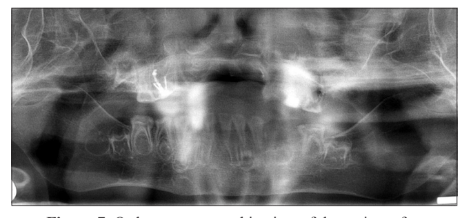
Figure 7: Orthopantomographic view of the patient after a 30 months follow-up

Thereafter, a dental treatment plan was established, and oral hygiene instructions and dietary recommendations were presented to her parents.