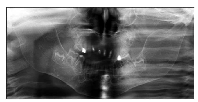
Figure 4 : Orthopantomographic view of the patient at the beginning of the dental treatment