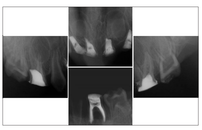
Figure 5: Periapical radiographies of the teeth after dental treatments