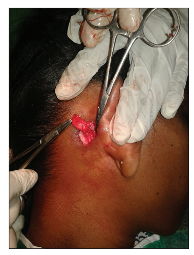
Figure 2: Intraoperative photograph showing well-circumscribed swelling, 2 cm × 2 cm in size with well-defined borders

Kimura's disease was first described in 1937 by Kim and Szetu in the China as eosinophilic hyperplastic lymphogranuloma but is more widely known as KD since its first description by Kimura et al. in Japanese literature in 1984. He reported similar cases under the title "On the unusual granulation combined with hyperplastic changes of lymphatic tissue." Over the years, there has been considerable confusion between KD and angiolymphoid hyperplasia with eosinophilia (ALHE). The confusion escalated by the introduction of an ever-expanding number of names applied to both diseases, including eosinophilic granuloma, eosinophilic granuloma of lymph node and soft-tissue, eosinophilic hyperplastic lymphogranuloma,