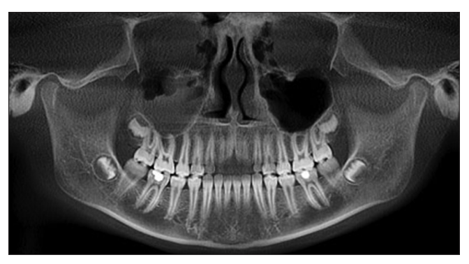
Figure 1: Panoramic image of mental foramen locations

The Cohen \kappa coefficient was found to be 0.879, showing high reliability and statistical significance (P = 0.001). The