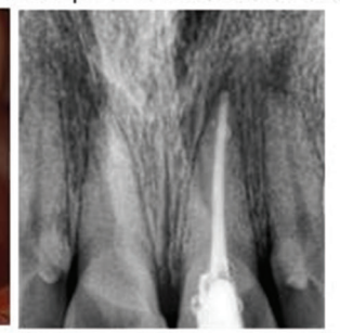
FIGURE IG - IOPAR at 12 mnt showed periapical changes in 22