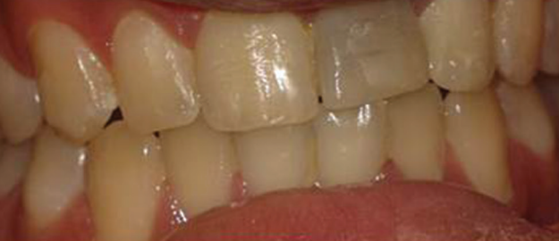
FIGURE IF - Discolored replanted tooth was noted at 12 months recall radiograph after splint removal visit. Non-Vital bleaching was initiated.