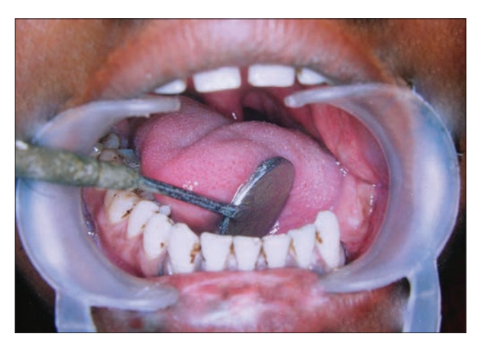
Figure 1: Intra-oral photograph showing swelling in the left mandibular region with obliteration of buccal sulcus

dental and family history of the patient was unremarkable. There was no history of trauma or pus discharge. Extra-oral examination revealed facial asymmetry due to swelling on the left side of the face extending anteroposteriorly from 3 cm anterior to the ear till the corner of mouth and superior-inferiorly, extended from infraorbital margin to inferior border of mandible. Clinical examination revealed firm to bony hard swelling in the left mandibular region with normal overlying skin. Intra-oral examination revealed obliteration of buccal sulcus in the region of 34, 35, 37 as seen in Figure 1. Orthopantomograph as observed in Figure 2 revealed multiple multilocular radiolucencies in the left side of mandibular body and ramus area involving coronoid and condylar process. There was thinning of inferior border of mandible. Posterior border of ramus and right side of mandible appeared normal. Coronal slice of computed tomography (CT) scan showed expansion of medial and lateral border of the left side of ramus with thick and curved bony septa and homogenous density [Figure 3a]. Axial slice CT at level of mandible showed soft tissue mass in left side of mandible with complete destruction of buccal and lingual plates and remnant of bone within mass extending into adjacent soft tissue with loss