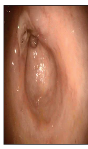
Figure 3: Forrest III gastric ulcer