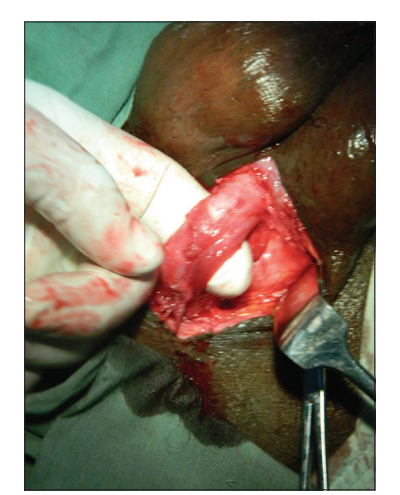
Figure 1: Bulbous urethra mobilized showing the stricture

All the patients were males and 87 in number. The age range was 11-68 years with a mean of 35.4 years and standard deviation 10.5 years. All had one stage anastomotic urethroplasty by perineal approach during the study period of 9 years. Nine (10.3%) patients after the evaluation had erectile dysfunction following urethral trauma. Posturethroplasty four (4.6%) patients experienced a decrease in the quality of penile erection that needed no treatment while 74 (85.1%) patients retained their potency. Thirty-nine (44.8%) patients were in the fourth decade of life. Road traffic accident caused a urethral rupture in 46 (53%) patients followed by straddle injuries in 17 (19.5%) patients [Figure 4]. There were pelvic ring and sacroiliac joint disruptions in 31 (37%) patients [Table 1]. The site of posttraumatic stricture was bulbo-membranous in 39 (44.8%) patients, membranous in 17 (19.5%) patients, and bulbous 31 (35.6%) patients. Road traffic accident caused traumatic stricture in both membranous