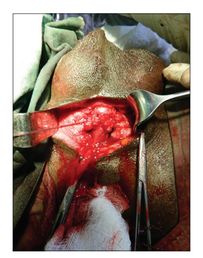
Figure 2: Anastomosis completed