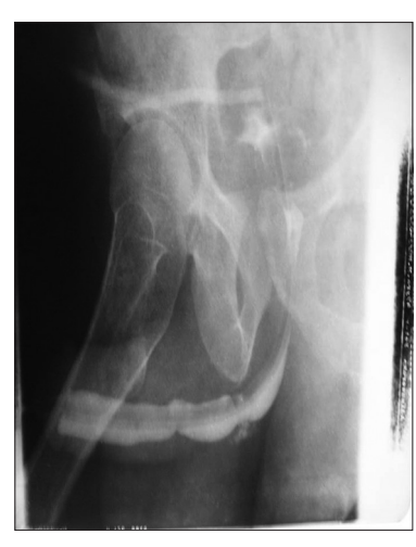
Figure 3: Post urethroplasty retrograde urethrogram

and bulbous segments of the urethra accounting for 52.8%. The stricture/defect length range was 0.8–3.2 cm with a mean of 1.9 cm. Thirty-one (35.6%) patients had bulbo-membranous anastomosis while 21 (24.2%) patients had bulbo-prostatic anastomosis. The remaining 31 (35.6%) had bulbo-bulbar anastomosis [Table 2].