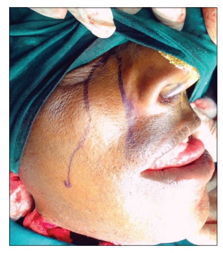
Figure 1: Marking of inferiorly based nasolabial flap

The mean age of the patients was 65 years. The mean size of the tumors was 3.5 cm. One female patient was excluded from the