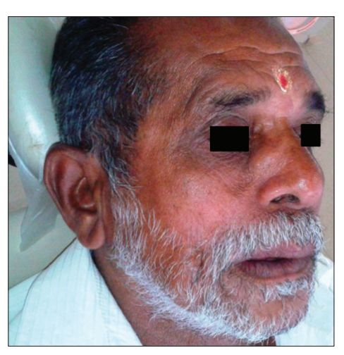
Figure 5: After a year extraoral flap harvested site. Esthetically acceptable

Since the size of the primary tumors ranged from 2 to 4 cm, a 1 cm margin would make the largest resection about 5 cm in maximum diameter. It is the experience of this author and another<sup>[6]</sup> that a single, inferiorly based pedicle flap is sufficient to reconstruct the resultant defect adequately, while most feel that 2 flaps are required to accomplish this task adequately.<sup>[7-9]</sup>