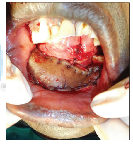
Figure 2: Nasolabial flap over ablative surgical defect