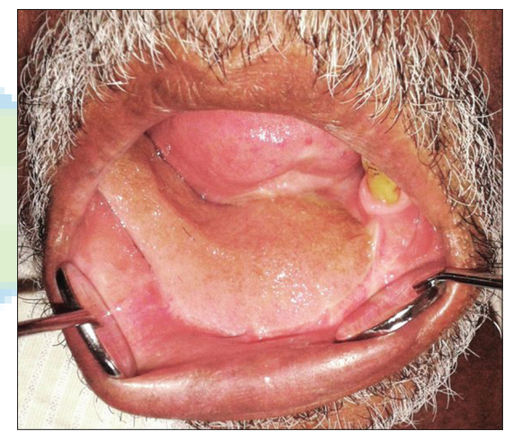
Figure 4: After a year nasolabial flap