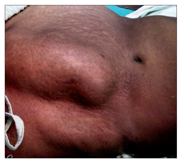
Figure 1: Abdominal wall hydatid