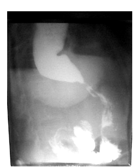
Fig. 3 Barium swallow (25 years post surgery): Filling defect seen on the R lateral lower border of the oesophageal wall

Fig. 1 Barium swallow (before surgery) showing marked dilatation of the entire esophagus with marked retention of barium