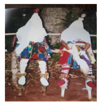
Plate 9: Ekeleke dance costume

The dance costume in Ekeleke is very symbolic. It is symbolic in the sense that it portrays the individual state of mind during the festival. Onyeama observed that; 'It is of belief that through the dance costume based on its symbolic colour 'white', the dancers are pure in thought, action and words. Throughout the dance performance based on the communicative potency of the colour white, the dancers are meant to uphold the truth and nothing but the truth.