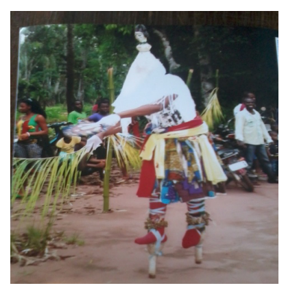
Plate 7: O kawala mma. (It is better!)