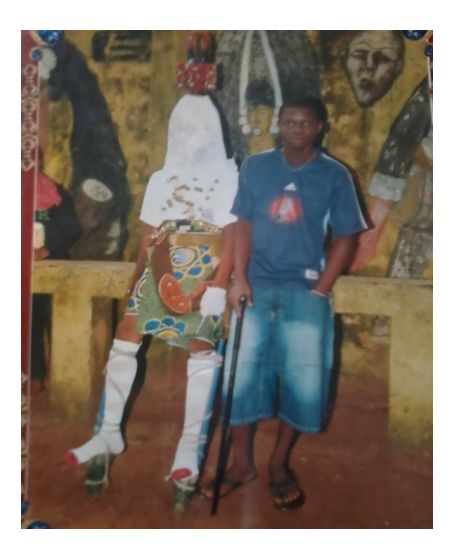
Plate 2: An initiate before initiation and after initiation