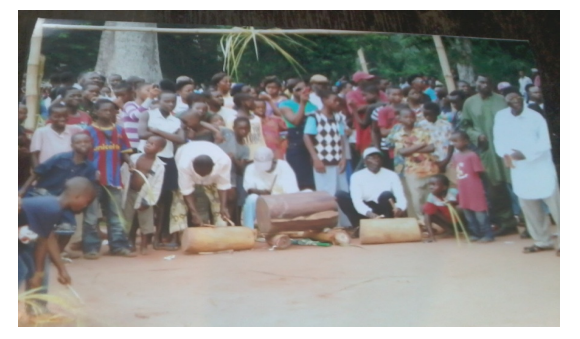
Plate 4: The ageless Drummers of Ekeleke dance and the symbolic ekwe(Onyeama, 2012)

Plate 3: The audience watching Ekeleke dance performance (onyeama 2012)