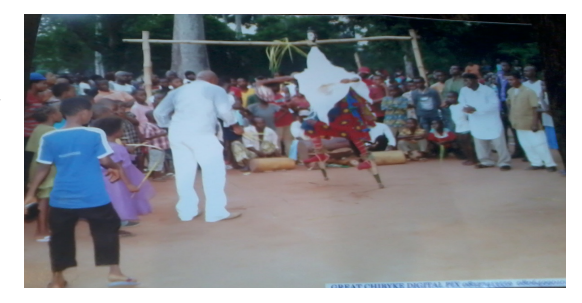
Plate 8: Ųgbų a buzi oge inwe anųrį (This is now time to be joyous)

bountiful harvest and in order to show appreciation during the period of this dance celebration, there is always much to drink and merry. The dance movement is of a free style where individual dancers make vigorous movements based on his strength and ability to follow the fast tempo of drums. The dancers dance to thank God and plead with him to continue His blessing.