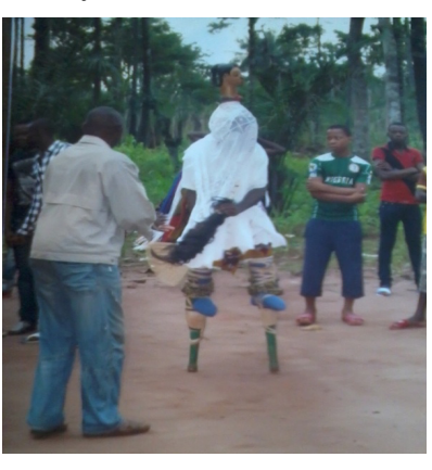
Plate 6: Olee mgbe o ga aka mma (When will it be better?)