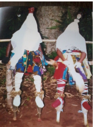
Plate 1: Ekeleke dance costume

The dance performance and its steps can only be taught by the Onyeisi Ekeleke who is the lead dancer and head of the performers. He is believed to be a descendant from the lineage of the Ekeleke lead dancers. The inspiration to choreograph the Ekeleke dance is believed to come from the gods and is bestowed on this lineage of dancers.