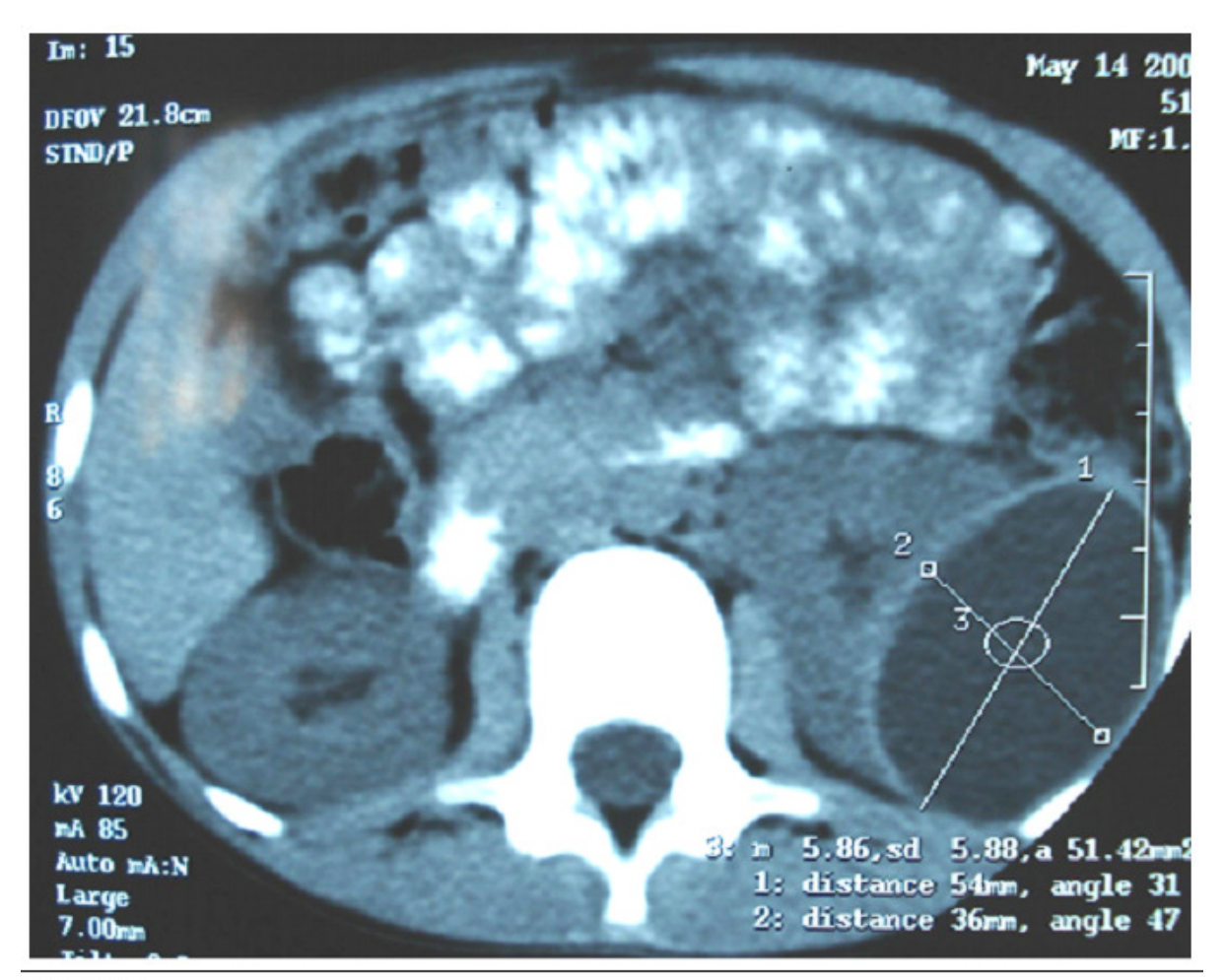
Figure 1 TDM aspect of a renal hydatid cyst