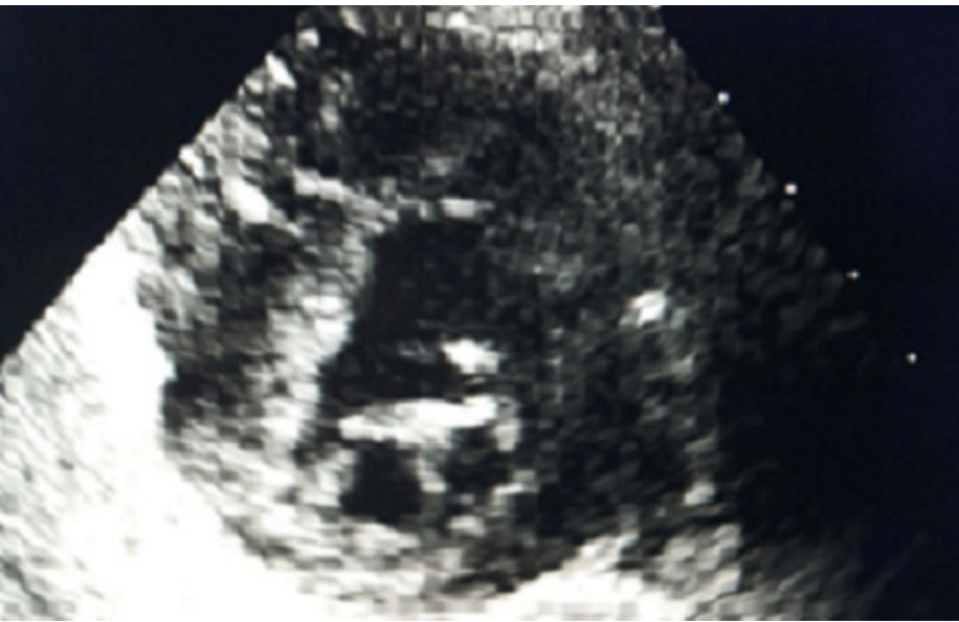
Figure 2: Postoperative echocardiography