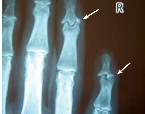
Figure 5: Erosive OA of the hand with classical “gull-wing” appearance (arrows) of the DIP joints

and pain is most commonly located in the groin, but less often referred to the lateral hip, buttocks or knee. Reduced extension and limited motion on internal rotation are characteristic early features of hip OA. The superior aspect is most commonly involved on radiographic images. Other causes of “hip pain” may include trochanteric bursitis, thoracolumbar or sacroiliac disease and intrapelvic pathology.