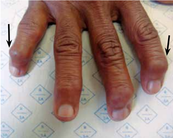
Figure 4: Nodal OA of the hand with Heberden's nodes at the DIP joints (arrows)

hard (osteophytes). The tendency to develop nodes may be familial. An erosive variant, which almost exclusively affects postmenopausal females, is characterised by frequent recurrent inflammatory flares over many years. Multiple DIP or PIP joints may be involved often resulting in deformity and ankylosis of the joint. Inflammatory markers (CRP and ESR) may be slightly elevated. Radiographs are characteristic showing central erosions with a hallmark “gull-wing” appearance (Figure 5). It is important to rule out superimposed gout in patients with erosive OA. Periarticular “punched out” erosions may be present with underlying tophaceous gout.