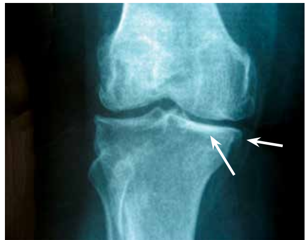
Figure 3: Radiograph of the knee shows medial joint space narrowing, subchondral sclerosis and osteophyte formation (arrows)

It is important to note that pain and severity of radiographic changes do not always correlate. However, patients with a longer history and persistent severe symptoms of OA are more likely to demonstrate structural X-ray changes. The characteristic X-ray features of OA include focal joint space narrowing, subchondral sclerosis, subchondral cysts and osteophytes (Figure 3). Calcification of cartilage may point to secondary OA and pseudogout. Weight-bearing standing radiographs of knees should be requested to correctly evaluate for joint space narrowing. Ultrasound and magnetic resonance imaging modalities are not discussed here.