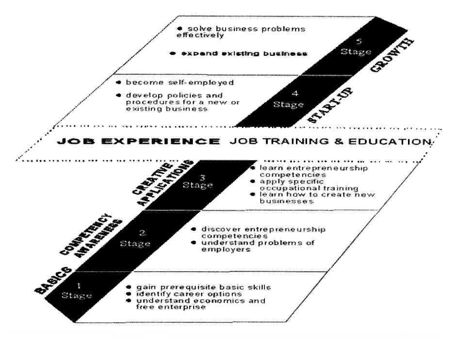
Figure 1 Stages of entrepreneurship training (Consortium for Entrepreneurship Training, 2004)

There is general agreement by researchers in the field of entrepreneurship that more emphasis should be placed on entrepreneurship education and training as opposed to business education. Business education has a more limited coverage than entrepreneurship education and training, which include additional topics, such as innovation and risk-taking, for example. The Consortium for Entrepreneurship Education (2004) points out that entrepreneurship education is a life-long learning process and consist of five stages, namely, basics, competency awareness, creative applications, start-up, and growth, as depicted in Figure 1.