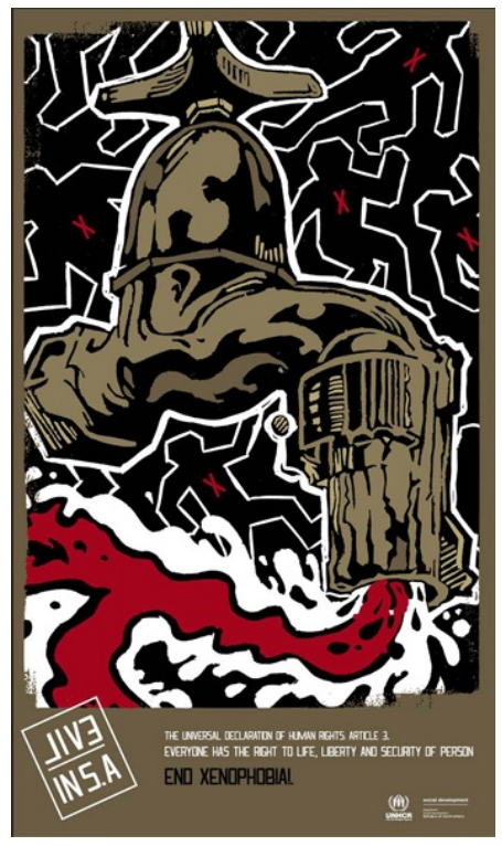
Figure 4 Student (B). Untitled Digital print. Size A4. 2008