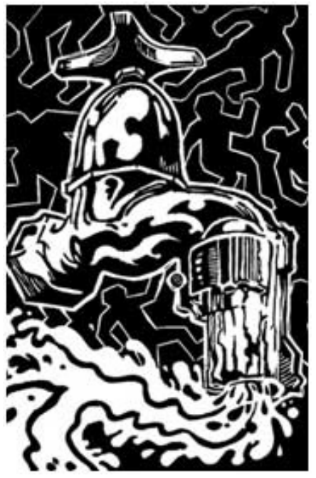
Figure 2 Student (B) Untitled Linocut print. Size A4. 2006

material wealth and discriminatory treatment by society. His journey to and from the university was educational, in the sense that he became aware of the lack of human rights practice among the people who mattered. In his first graphic print based on Article Twenty Four of the Bill of Rights, that is, 'Environment' (Republic of South Africa, 1996:24), Student A explained that this image was as much about social inequity as it was about the environment. In his print (Figure 1), the symbolism is two-fold; firstly, the upper composition depicts the environmental effects of industrialization and globalization, that is, the way in which technological advances in industry and global communications pay scant regard to their effect on the environment. The image addresses the danger of rampant pollution in a fragile natural world, symbolized by the brittleness of an animated tree. Student A juxtaposes technology with poverty symbolized by the group of urban dwellers, which he based in the township of Soweto. The composition addresses the sharp distinction between the level of historical disenfranchisement that contrasts an image of urban poor people against the economic advantage of a growing technology and communications sector.