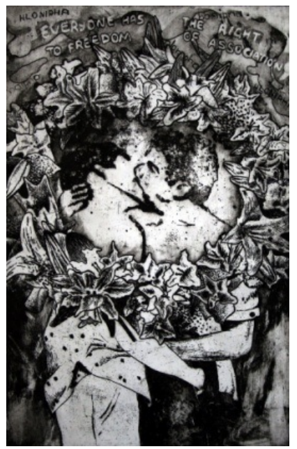
Figure 3 Student (C). Second Year: Etching. Untitled. Size A4. 2009

The second-year printmaking module of the Visual Graphics course comprises a series of five projects over the year that aim to engender a critical sense of social responsibility. The third example (Student C) referred to in this article is an etching project based on an Introduction of the Civic Learning Spiral. The theme explores an aspect of social justice which introduces notions of civic engagement in the education process.