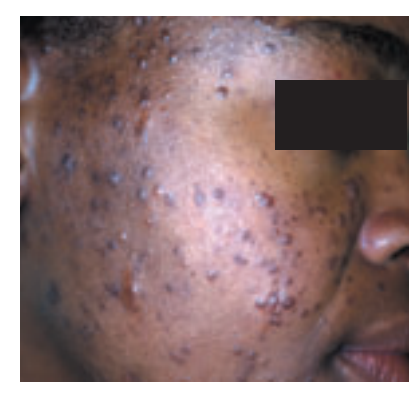
Fig. 10. Disseminated histoplasmosis facial lesions.

Other systemic mycoses that may occur but are rare in South Africa are