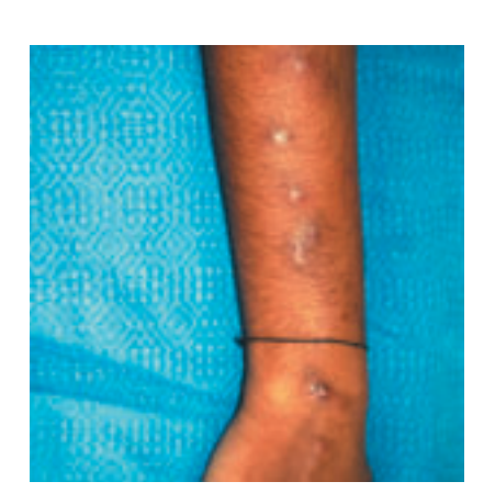
Fig. 12. Linear sporotrichosis.

blastomycosis, penicilliosis and coccidioidomycosis. Accurate diagnosis can only be made utilising pathological and mycological investigations. As more patients are being treated with HAART, the incidence of systemic fungal infections will decline.