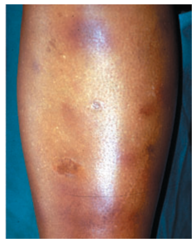
Fig. 19. Erythema nodosum, lower limbs.

partly because of the widespread use of antituberculosis therapy. Cutaneous lesions can present as papules, pustules, abscesses and ulcers. Lesions may present as nodules involving ascending lymph nodes of a limb. Biopsy and culture is essential for an accurate diagnosis, and therapy with clarithromycin and rifampicin is effective.