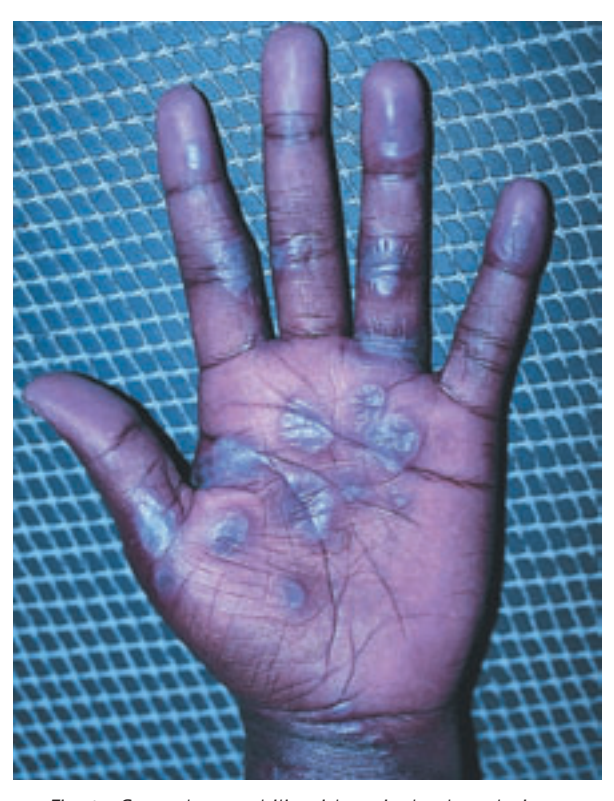
Fig. 15. Secondary syphilis with typical palmar lesions.

therefore at increased risk of presenting with cutaneous hypersensitivity reactions.