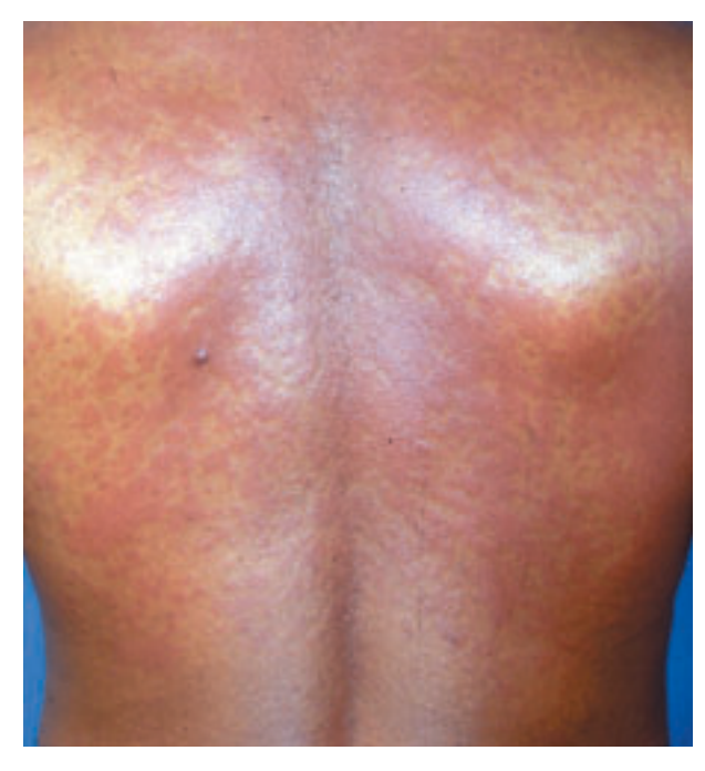
Fig. 2. Morbilliform rash of acute seroconversion illness.

The incubation period from the time of exposure to the development of an acute febrile syndrome is about 2 - 6 weeks. It is estimated that 50 - 70% of patients will have the acute syndrome after infection, however, of these only 25% have symptoms severe enough to warrant medical attention. Patients present with an infectious mononucleosis-like picture characterised by fever, sore throat,