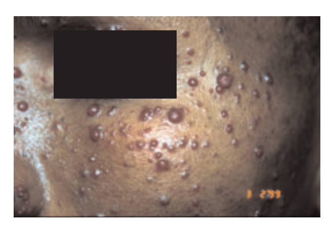
Fig. 13. Bacillary angiomatosis.

This rare condition caused by the spirocheate Rochalimea henselae presents with angiomatous papules, nodules and abscesses (Fig. 13). It occurs in patients with severe immunosuppression and may be clinically confused with Kaposi's sarcoma. Systemic involvement may occur with pulmonary, hepatic, bone and central nervous system symptoms. Histology is important as it is a fastidious organism and hence difficult to culture. Patients respond well to erythromycin 500 mg 6-hourly or doxycycline 100 mg twice a day until the lesion resolves. If the condition is recurrent, secondary prophylaxis is necessary. Alternative drugs are the cephalosporins and quinolones.