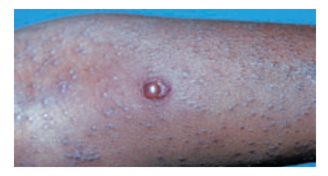
Fig. 18. Lichen scrofulosorum with blistering mantoux.