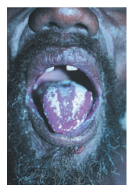
Fig. 3. Oral candidiasis.

Candidiasis most often affects the tongue and buccal mucosa, causing thick, whitish plaques, but may also present as angular cheilitis. (Fig. 3). Less common manifestations are paronychia (Fig. 4), onychomycosis, recurrent vaginal and urethral involvement and cutaneous involvement, predominantly of the flexures. Children may present with candidiasis in the napkin area and other flexures (axillae and neck folds) and chronic paronychia with nail dystrophy. Severe oral involvement with dysphagia indicates oesophageal candidiasis. Disseminated candidiasis, although rare, is often fatal and should be