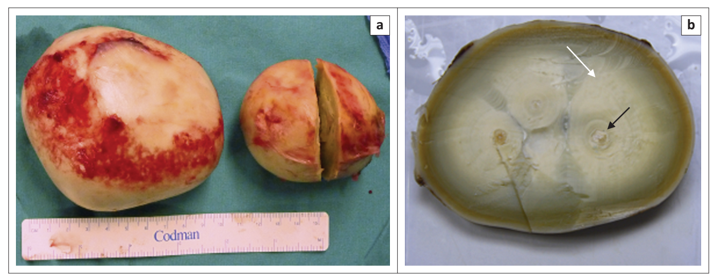
FIGURE 2: The two giant peritoneal loose bodies removed after laparotomy (a). Note the boiled egg appearance as described by Sewkani et al.<sup>1</sup> A section (b) through one of the peritoneal loose bodies demonstrates the calcified centres (black arrow) with laminated fibrous connective tissue arranged concentrically around them (white arrow).

bodies or 'mice'),<sup>1,2</sup> they may present with urinary retention and bowel obstruction,<sup>1,2</sup> necessitating surgical removal.