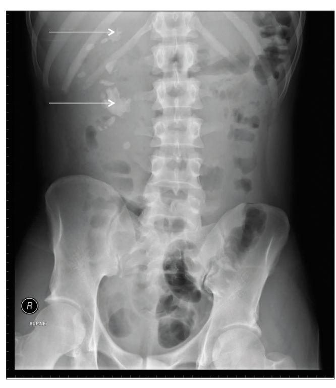
Fig. 1. Anterior X-ray demonstrating numerous well-defined densities (white arrows) projecting over the middle and upper aspects of the right abdomen.

process of the renal parenchyma with abscess formation. XGPN occurs in approximately 1% of all renal infections. XGPN is four times more common in women than men, and is usually noted in the 5th and 6th decades of life. XGPN displays neoplasm-like properties capable of local tissue invasion and destruction, and is occasionally referred to as a pseudotumour. [2] Most cases occur in the setting of infected obstruction owing to renal calculi. The pathognomonic microscopic feature is that of lipid-laden, foamy macrophages; [3] hence the prefix xantho-, from the Greek xanthos, meaning yellow.