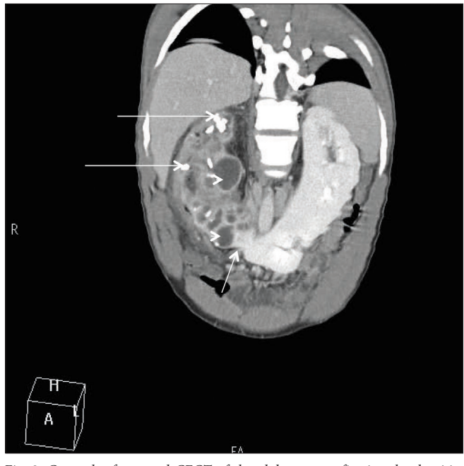
Fig. 2. Coronal reformatted CECT of the abdomen, confirming the densities to be right-sided renal calculi within a horseshoe kidney (long arrows). Note the isthmus, where the two kidneys are connected at their inferior poles (short arrow). Multiple focal hypo-attenuating lesions are scattered throughout the right aspect of the horseshoe kidney (arrowheads).