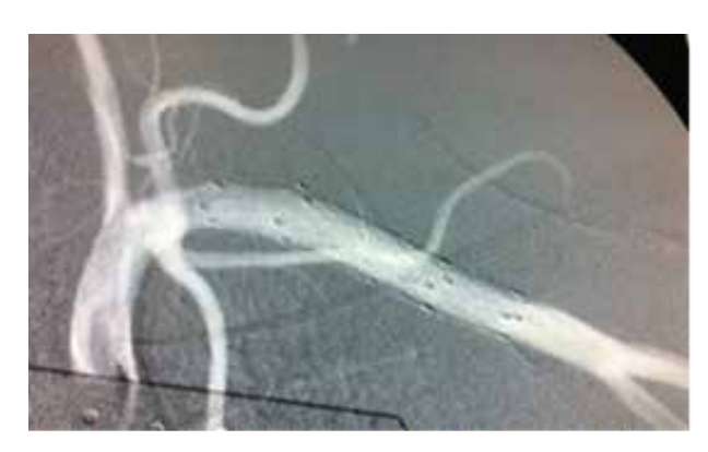
Figure 1 b: Left subclavian artery pseudoaneurysm after stenting