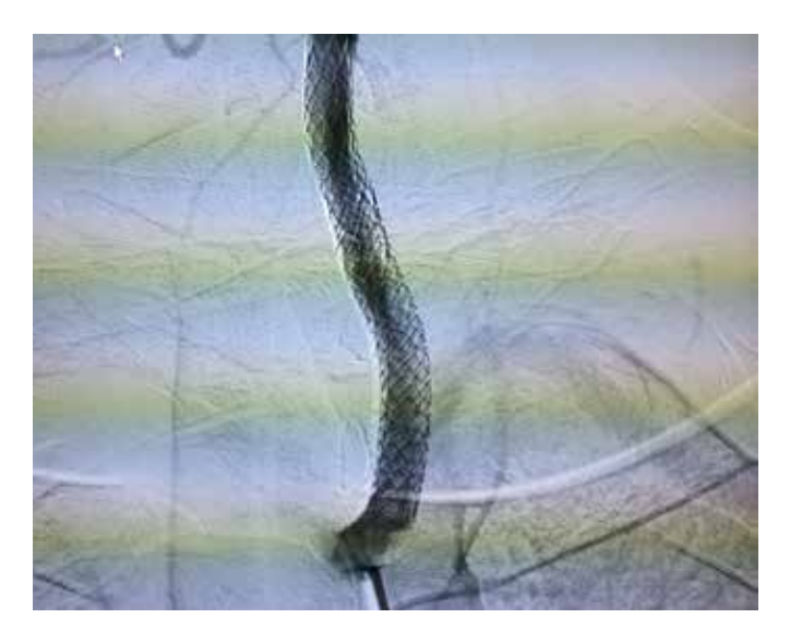
Figure 2 b: Left common carotid artery pseudoaneurysm after stenting

Seven patients (8%) were referred to the quaternary centre at Inkosi Albert Luthuli Central Hospital, Durban. The disciplines to which the patients were referred were cardiothoracic surgery (2) and vascular surgery (5). Aortic arch injuries (2) were repaired operatively with cardiopulmonary bypass, descending aortic injuries (2) were treated by stent graft, and common carotid (1) and subclavian artery injuries (2) were treated by open repair at the quaternary centre.