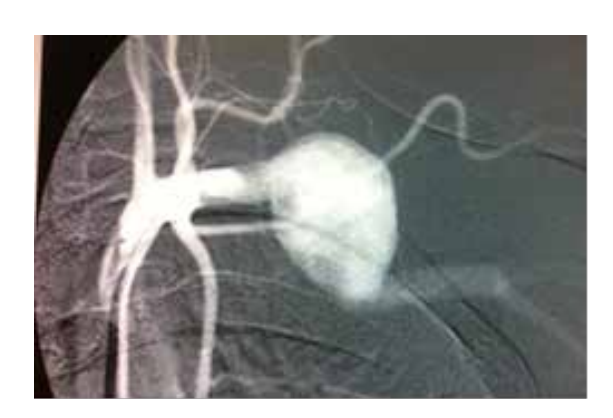
Figure 1 a: Left subclavian artery pseudoaneurysm before stenting

artery (1) and dorsal scapular artery (1). Seven patients (8%) were treated expectantly; vertebral artery (2), internal carotid artery (2) and descending aortic (3) injuries.