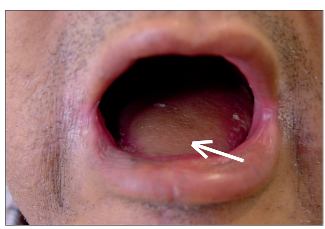
Fig. 2. Convex floor of mouth reconstructed with pectoralis major flap (white arrow).

Upwardly convex floor of mouth (FOM). The reconstructed FOM must be upwardly convex in order to prevent saliva and food pooling in the mouth, and to facilitate oral transport and speech (Fig. 2). This requires a bulky musculocutaneous flap such as latissimus dorsi and pectoralis major pedicled flaps, or anterolateral thigh or rectus abdominis free flaps. As the muscle of the flap will atrophy, the flap must appear too bulky at the time it is inserted. A fasciocutaneous flap such an RFFF does not provide adequate bulk. Doing a complete marginal mandibulectomy and suturing the flap to the gingivobuccal mucosa obliterates the lateral sulci in the mouth, and further