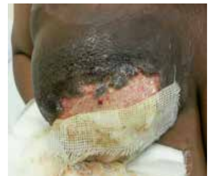
Fig. 1. Locally advanced carcinoma of the right breast.

NAC refers to chemotherapy prior to surgery and is the current standard of care for LABC. It has many potential benefits over immediate surgery and postoperative adjuvant chemotherapy in the management of LABC, which include eradication of occult distant micrometastases and downstaging of a previously unresectable breast malignancy to an operable one. Another