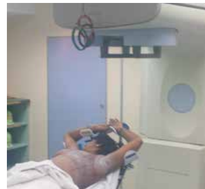
Fig. 2. Left chest wall radiation therapy.

Indications for post-mastectomy radiotherapy (PMRT) include patients with T3, T4 tumours and those with ≥4 positive axillary nodes. In patients with 1 - 3 positive axillary nodes, locoregional radiotherapy may be considered for young patients, large T2 - 3 tumours, grade III tumours, ER-negative, lymphovascular invasion or lobular histology. [12]