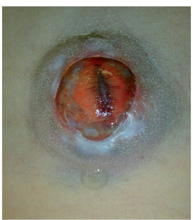
Fig. 1. Clinical photograph showing a typical myelomeningocele. The open spinal cord is readily appreciated, with the midline fold continuous rostrally with the central canal of the spinal cord. Leaking CSF can also be seen.

The term spina bifida is used to refer to a range of different conditions. The simplest form is incomplete closure of the posterior elements of one of the lower lumbar or sacral vertebrae. This is very common (around 10% of the population) and incidentally noted on X-ray, but seldom of any clinical relevance. Spina bifida occulta or closed spina bifida refers to a range of rare but characteristic congenital abnormalities involving the lower spinal cord, such as a lipoma, myelocystocele or split cord; usually there is an overlying cutaneous abnormality (such as a subcutaneous lipoma, naevus or hairy patch) and pathophysiologically the spinal cord is tethered and vulnerable. Spina bifida aperta or open spina bifida is almost always a myelomeningocele, where the spinal cord and meninges are exposed on the dorsal surface of the infant at