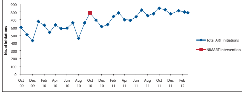
Fig. 3. Trends in total ART initiations in region F PHCs.