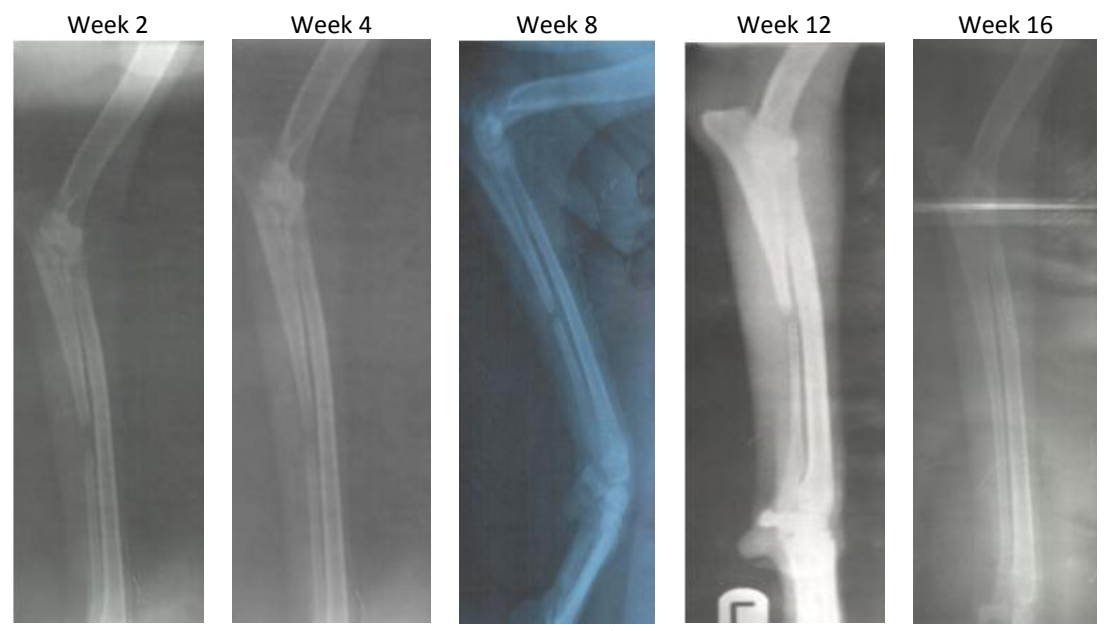
Figure 2: Serial radiograph of dogs treated with BMP-2/HA implants