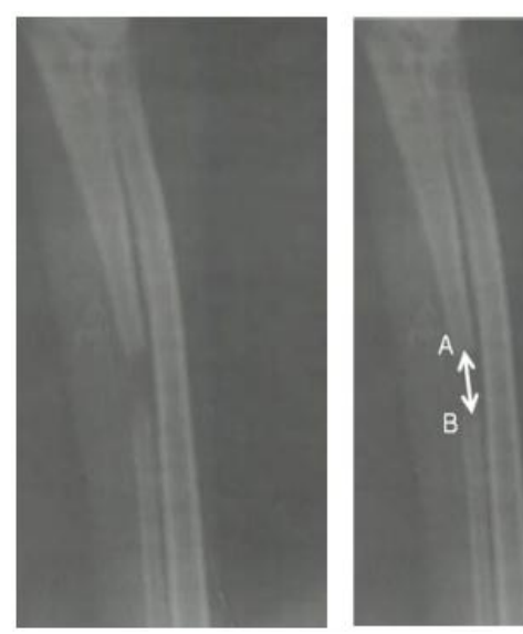
AB (mm) = Fracture Gap (FG)

Different superscripts in the rows indicate significant difference between the groups (p<0.05). Parameters reported as Mean \pm SEM