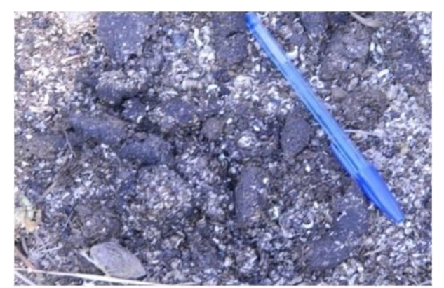
Figure 3: One of the civetries in the study area. Note the presence of large number of intact seeds and remains of invertebrates in the droppings