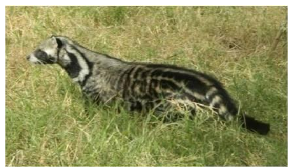
Figure 1: African Civet in Arba Minch forest

The African Civet ( Civetticus civetta ) is an elusive, nocturnal, omnivorous and territorial scent marking viverrid, distributed throughout sub-Saharan Africa; usually close to perennial wetlands (Ray, 1995; Bekele Tsegaye et al. , 2008a, 2008b). Not only is it the largest representative of Viverridae, but also a bioindicator of forest habitat dynamics akin to most other Civet species (Mudappa et al. , 2010; Rabinowitz, 1991). Civettictis civetta is a stocky animal with a long body, and is shortlegged for its size although its hind limbs are noticeably larger and more powerful (Figure 1).