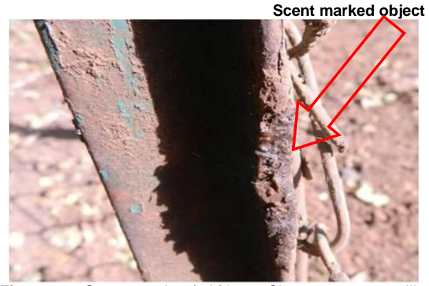
Figure 4: Scent mark of African Civets on a metallic object for many times

marks were observed was 32 cm. In the wild, the mean amount of civet musk that could be collected from each marked site (Table 3) varied from 0.0047 to 0.98 (g), but in captivity, 0.034 to 2 (g) civet musk was measured. Most scent marked sites (96.72%) were within 100 m radius of civetries.