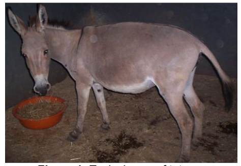
Figure 1: Typical case of tetanus

Hyperesthesia, elevated tail, flicking of the nictitating membrane on touch, extended head, stiff gait, dilated nostrils and erect immobile ears were the common clinical signs observed (figure 1). Trismus, dyspnoea and recumbency were also encountered in some animals.