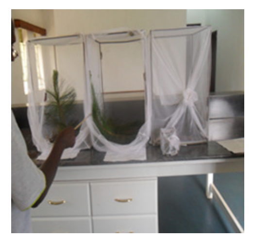
Figure 3. Rearing Gpodocarpi in Kifu lab.

gilvoides. Using first generation stages from the laboratory ensured starting the experiment with healthy eggs, larvae, pupae or adults. To establish vulnerability of the different stages to parasitism by P.gilvoides, 8 adult moths (4 males and 4 females), 24 eggs, 24 larvae and 24 pupae were placed in separate cages measuring 43 cm wide X 43 cm deep X 60 cm high (Fig. 3). The cage frames were made from 8 mm wire, welded at the corners and covered with muslin netting with a base of thick khaki cloth. The netting was designed to open in front to allow access and monitoring of the study materials. For the cage housing larvae, two P. patula seedlings were placed into each of the cages as sources of food for the larvae and rest places when moths emerged. 3 male and 3 female P. gilvoides were introduced into each of the cages (Fig. 4). The different G.podocarpi growth stages (eggs, larvae, pupae and adults) were monitored for parasitism by examining them for mortality and symptoms of attack from from P.gilvoides. Dead larvae, pupae and adults were also dissected to observe parasites attacking them. Eggs that did not hatch were broken carefully