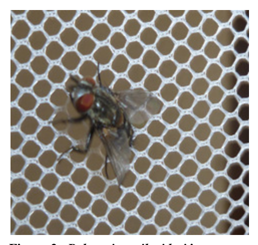
Figure 2. Palexorista gilvoidesi in a cage.

daily temperatures vary between 10.7° C and 23.9° C. They are planted mainly with pines but have a few cypress tree species.