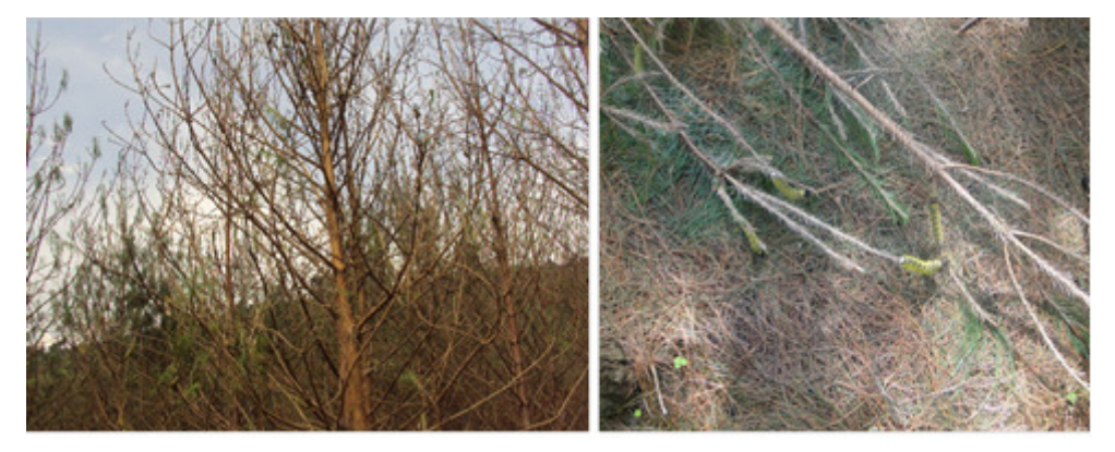
Figure 1. Gonometa podocarpi damage in Kiriima

Effectiveness of a biological control agent