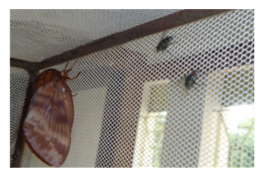
Figure 4. Palexorista gilvoidesi introduced against adult Gpodocarpi in a cage

Gonometa podocarpi was present in Mafuga and kirrima CFRs. No G.podocarpi was observed in Muko CFR. Nine out of the 51 compartments in Kiriima and Mafuga pine plantations had incidence of G. podocarpi (Table 1). The highest damage was in Kiriima with all the 5 affected compartments having damage levels ranging from 60-100% of the crop (Fig. 1 and Table 1). The cause of death in G. podocarpii was a parisitoid, P. gilvoides. Its parasitism levels varied in the field and laboratory, (62 % in the laboratory and 43% in the field) and life cycle stages attacked (Fig. 5). No parasitism was observed in the egg and adult stages. Highest parasitism was larval parasitism (43% in the field and 62%) in the laboratory compared to pupa stage parasitism level of 6% in the field and 8% in the laboratory. Many parasitised larvae had up to eight puparia in their bodies.