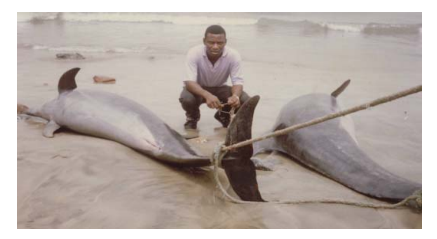
Fig. 2. Two common bottlenose dolphins, Tursiops truncates , pulled up the beach by artisanal fishermen at Jamestown, near Accra, on 5 Feb 1994.

Earliest documented records. Two freshly captured common bottlenose dolphins were landed by a purseseiner at Jamestown on 5 February 1994 (Fig. 2). One, a 300-cm male, was necropsied at CSIR and its skull, scapulae, four vertebrae (including atlas and axis), os hyale, partial sternum, one rib, one humerus and ulna, several teeth and a tissue sample (in DMSO) were collected. A second and a third common bottlenose dolphin, of 255 cm and 315 cm length, were brought ashore at Senya Beraku (05° 23' N, 00° 29' W) and Tema, respectively. These dolphins were previously reported but equivocally assigned to Delphinus delphis (Ofori-Danson & Odei, 1997). A calvaria dredged by a fishing boat from an indeterminate site in Ghana's shelf waters, collected by Dr Ofori-Adu sometime before 1998, was identified by KVW at the Tema Research and Utilization Branch of the Fisheries Department (Ministry of Agriculture).