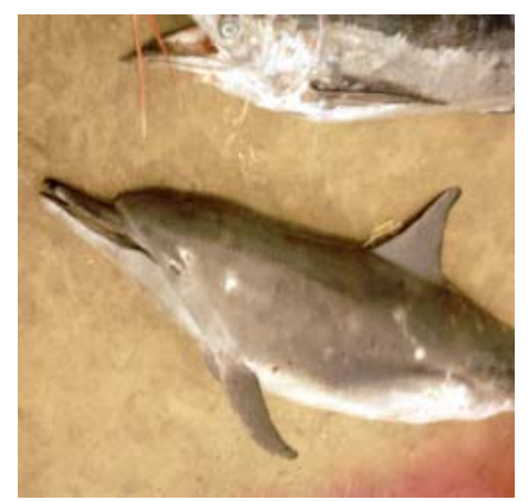
Fig. 4. Pantropical spinner dolphin, Stenella longirostris longirostris , encountered at Axim in 2000. Diagnostic characters include the very elongated rostrum, dark-tipped dorsally, triangular and pointed dorsal fin, small flippers and the three-partite patterned body (dark cape, grey lateral field, white ventral field).

Distribution and natural history . Three other specimens are documented from the region. These include a specimen from La Côte d'Ivoire (van Bree, 1971), a skull (CBL 414 mm) from a 188-cm female, archived at the US National History Museum (USNM470557) and examined by Van Waerebeck on 14 May 1999, which originated from Abidjan, La Côte d'Ivoire, and another skull from Liberia curated at the Leiden Natural History Museum (Broekema, 1983). S. longirostris , typically wide-ranging oceanic dolphins, are likely to occur throughout deeper waters of the eastern tropical Atlantic. Weir (2007) reported sightings in deep pelagic areas off Angola.