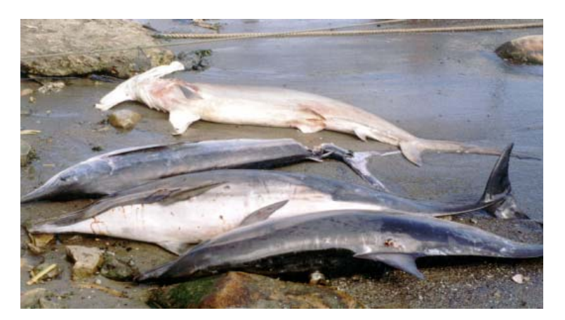
Fig. 7. Two long-beaked common dolphins, Delphinus capensis , landed alongside a smooth hammerhead shark and an unidentified billfish (Istiophoridae) at Dixcove, on 18 Oct 1999. Note the harpoon/lance entry wound at the right side under the dorsal fin of the (lower) dolphin.

Earliest documented records. Fishermen landed two long-beaked common dolphins of adult size at Dixcove on 18 Oct 1999 (Fig. 7), the species' first confirmed record for Ghana. A third specimen was landed at Axim on 19 June 2000, from which the cranially mature skull was obtained (DOF 20/010). Voucher skulls for another three individuals (DOF 20/02, 20/022, 20/023) were collected by the authors. Cranial features diagnostic of D. capensis include a lanceolate- or pseudo-lanceolate-shaped palate ( versus trapezoid shape in D. delphis ; see Van Waerebeek, 1997) and a high ratio (1.70–1.83) of rostrum length to zygomatic width (Heyning & Perrin, 1994; Jefferson & Van Waerebeek, 2002).