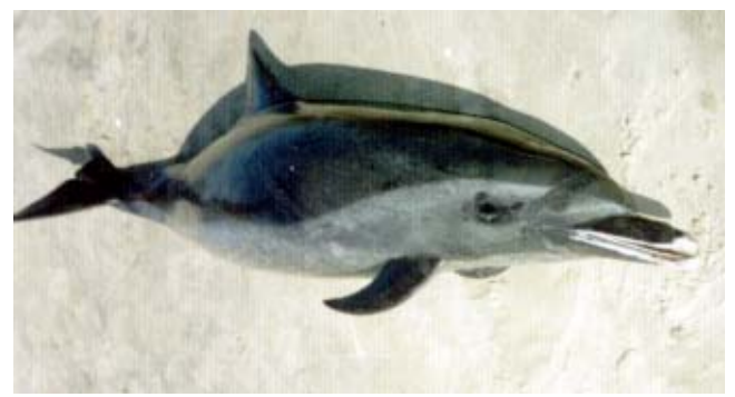
Fig. 5. A fresh pantropical spotted dolphin, Stenella attenuate , landed by Apam fishermen in 1998. Note the brilliant white lips and tip contrasting with an otherwise dark rostrum, the prominent dark cape dipping low onto sides forward of the dorsal fin, grey lateral and ventral fields (with moderate, white spotting), and smallish dark pectoral fins. The gape to flipper stripe is muted in this individual.

Distribution and natural history. In the wider study region, the pantropical spotted dolphin has been documented from La Côte d'Ivoire (Cadenat & Lassarat, 1959b; van Bree, 1971), Gabon (Fraser, 1950a) and offshore waters of the eastern tropical Atlantic (Perrin et al. , 1987). An earlier reference for Ghana (C. W. Oliver, pers. comm. in Jefferson et al. , 1997) is not supported by voucher data, but Chuck Oliver, a trained dolphin/tuna observer at the Southwest Fisheries Science Center, La Jolla, California, is considered a trusted source (William F. Perrin, pers. comm.). No records exist from the Atlantic coast of South Africa (Findlay et al. , 1992).