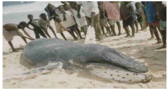
Fig. 18. An emaciated neonate humpback whale stranded at Ada, eastern Ghana, in Sept 1997. Photographed when freshly dead, it is unclear whether the animal died on the beach. Ghana's coast forms part of the distribution range of a 'Gulf of Guinea' breeding stock, whose calving seasonality and exclusive presence in austral winter months firmly points toward a Southern Hemisphere population.

Distribution and natural history. Rasmussen et al. (2007) encountered several humpback whale pods (fluke photo-ID taken for two individuals) including a mother and possible newborn calf in Ghanaian waters between 04' 02.676" N, 01' 56.015" W and 04' 54.402" N, 00' 35.895" W on 1 and 2 Oct 2006. Considering the exclusive presence of humpback whales from early August till late November, and the frequent observations of neonates and 'competitive groups' (Clapham, 2002), it is evident that the continental shelf of Benin, Togo, Ghana, and western Nigeria hosts a breeding/calving population with a Southern Hemisphere seasonality (Van Waerebeek et al. , 2001) for which the authors propose the name 'Gulf of Guinea stock'. Its parapatric distribution suggests it may be related to the IWC-defined breeding stock 'B' from central-west Africa (IWC, 1998, 2006). Mother/calf pairs have been sighted exclusively nearshore in Benin, sometimes just beyond the surf-zone. The westernmost authenticated record is a stranding at Assini Mafia (05° 7'25" N, 03° 16'40" W), eastern La Côte d'Ivoire, on 26 Aug 2007 (Van Waerebeek et al. , 2007).