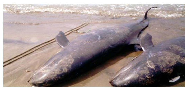
Fig. 14. Two false killer whales, Pseudorca crassidens , landed at Apam in 2003. Combined, the rounded head, almost entirely black colouration, curved flipper shape and the dorsal fin positioned slightly behind mid-back are diagnostic.

Earliest documented records. Three false killer whales were landed as bycatch at Apam, i.e. two adults on an unspecified date in 2003 (Fig. 14) and a 197-cm juvenile (photo archived) on 24 Sept 2003. The species' presence in Ghana is here documented for the first time.