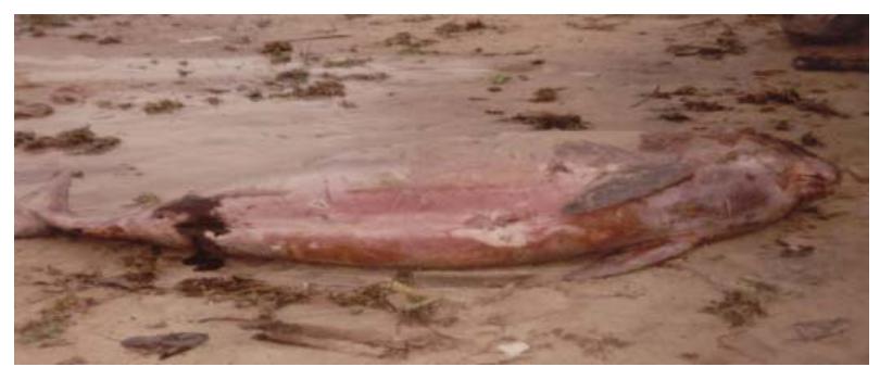
Fig. 16. A dwarf sperm whale, Kogia sima, landed as bycatch at Apam in 1998.

Earliest documented record. Apam fishermen brought ashore a 120-cm dwarf sperm whale calf on 23 Aug 1998 (Fig. 16), the first evidence of this species for Ghana and the Gulf. One of the authors, Debrah, collected the skull for the UOG collection. Despite physical immaturity of the specimen, cranial characteristics including tooth counts (LL9, LR9, UL5, UR5) firmly identify it as K. sima , the only Kogia species that may bear teeth in the upper jaw (Caldwell & Caldwell, 1989). In addition, the closely related pygmy sperm whale, K. breviceps , has more teeth (10–16 pairs) in the lower jaw.