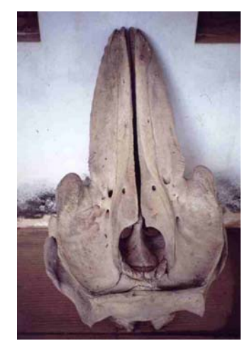
Fig. 13. Skull of a killer whale, Orcinus orca , from an unspecified location in Ghana, curated (without catalogue number) at the University of Ghana, Legon. In dorsal view, the concave lateral borderline of the premaxillaries allows a quick differentiation from the straight and parallel premaxillaries in Pseudorca crassidens . In ventral view, teeth and alveoli are diagnostic.

Earliest documented record. The skull (without catalogue number) of an adult killer whale is held at the Zoology Department, UOG (Fig. 13). According to the curator it has been in the collection for many years, and was collected at an unknown location in Ghana, possibly in 1956. Teeth and corresponding alveoli are oval in cross-section (diagnostic) versus circular as in Pseudorca crassidens .