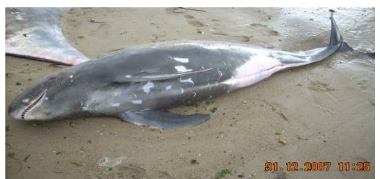
Fig. 11. This adult-sized pygmy killer whale, Feresa attenuata , landed at Dixcove beach on 31 Dec 2007 is the first authenticated record for the Gulf of Guinea. A low count of large, conical teeth and somewhat rounded flipper tips (visible here) sets this species apart from the morphologically similar melon-headed whale.

Earliest documented records. An adult-sized pygmy killer whale (Fig. 11) was landed at Dixcove on 31 Dec 2007 and was photographed by fisheries observer, Amiah Johnson.