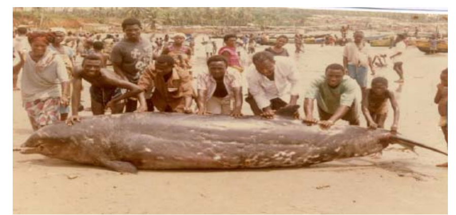
Fig. 15. A juvenile Cuvier's beaked whale, Ziphius cavirostris , landed at Axim in May 1994, the first record of a beaked whale in the Gulf of Guinea. Note the very short beak, the steeply sloped head, robust body and the dorsal fin located at 2/3 distance posteriorly. (Photo courtesy D. Vanderpuje).

Distribution and natural history. Cuvier's beaked whale is a cosmopolitan pelagic species in tropical to warm temperate waters. Weir (2006b) described a group of three Cuvier's beaked whales southwest of Luanda, Angola, at 07° 15.84' S, 11° 07.79' E, and reported a group of 3-4 'likely Cuvier's beaked whales' NW of Luanda. Four other beaked whale sightings off Angola were not identified, but Z. cavirostris was possible in three cases, the fourth was a Mesoplodon sp. All encounters were over deep water seaward of the continental shelf (Weir, 2006b). Three stranded Cuvier's beaked whales are known from Namibia (21°-23° S) and another two from the Atlantic coast of South Africa (Findlay et al. , 1992; Ross & Tietz, 1972).