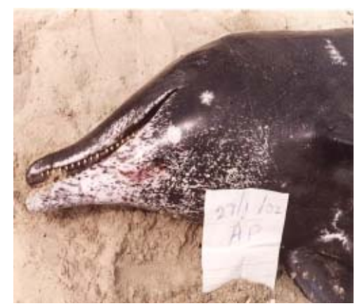
Fig. 8. A rough-toothed dolphin, Steno bredanensis , landed at Apam on 27 Jan 2002. The long-sloping head without melon crease, irregular ventral spotting and large flippers are indicative for this deep-water species.

Earliest documented records. Artisanal fishermen operating from Apam landed two rough-toothed dolphins in late summer 1998 (date indeterminate either 29 Aug or 24 Sept 1, 1998). Photographic evidence (archived in Corewam's Ghana Cetacean Database) shows the unmistakable conical tapering head and the large, pointed flippers. A third specimen, a juvenile, was offered for sale in Apam on 17 Oct 1999 (photos see Debrah, 2000, p. 33; Van Waerebeek et al. , 1999) and a fourth, larger individual (Fig. 8) on 27 Jan 2002, all at Apam. (C. W. Oliver, pers. comm. in Jefferson et al. , 1997) reported two undocumented sightings off Ghana in 1972, which, nonetheless, are considered reliable (W. F. Perrin, pers. comm. to Van Waerebeek).