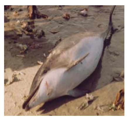
Fig. 3. The Clymene dolphin, Stenella clymene , is the most frequently landed cetacean in Ghana. Shown here is a freshly dead specimen, captured off Winneba.

Earliest documented records. Ghanaian fishermen are most familiar with the Clymene dolphin, sometimes calling it the 'true dolphin' or 'Etsui Papa' because the species is so frequently found entangled in fishing gear. A probable bycatch specimen from Keta (05^{\circ} 55' \text{ N}, 00^{\circ} 59' \text{ E}) in May 1956 (Prof. Chris Gordon, pers. communication) is the earliest specimen record in the Gulf. The physically mature skeleton is mounted (without number) in the Zoology Department museum at UOG (alveoli counts, 41UL, 42 LL). A second specimen, a 216-cm female, with sharply pointed teeth (38UL, 39LL), was captured off Winneba on 23 September 1998 (Fig. 3). The tripartite body colouration, including a white belly, black eye patch, grey eyeto-flipper stripe, a characteristic dark stripe along the middle of the upper rostrum ending in a black rostrum tip, and fine blackish lip patches were evident (Perrin et al. , 1981). A third, juvenile, specimen (99/03) was landed at Apam on 20 July 1999 (its head was shown as Plate B in Ofori-Danson et al. , 2003). No helminth parasites were found in the cranial sinus system. Since then a total of 13 cranial specimens has been collected from bycatches, now archived at UOG (98/01; 98/02; 98/03; 98/04; 98/05; 98/06; 98/07; 98/09; 98/11; 99/02; 99/03; 20/09B; 20/036).