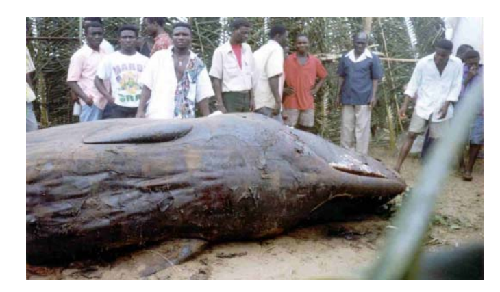
Fig. 17. A sperm whale, Physeter macrocephalus , stranded at Accra in Jul 1997 is the focus of a customary burial ceremony performed by local fishermen. Several (but not all) coastal communities in Ghana, Togo and Benin traditionally venerate whales and other cetaceans.

Earliest documented record. A sperm whale of some 7–9 m length (estimated from relative size of humans in photo) stranded at Osu beach, Accra, in July 1994 (Fig. 17). The cause of death was unknown and the only voucher data are three photographs. A second sperm whale, a decomposed shark-damaged carcass, stranded at Dixcove at an indeterminate date in 2002, is also supported by photographs. Both whales were of unknown sex.