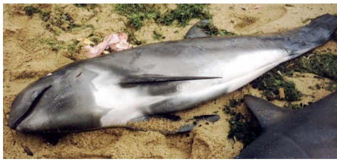
Fig. 9. Risso's dolphin, Grampus griseus , calf at the Dixcove landing beach on 16 Jun 2000. Its flukes had been severed before landing and it was cut in four pieces and sold on the spot.

Earliest documented records. Fanti fishermen have long been familiar with the Risso's dolphin and call it Eko tui (parrot dolphin). One of the authors (Debrah) sampled a juvenile male Risso's dolphin (99/05) at Apam on 4 Nov 1999. On 16 June 2000, Van Waerebeek and Ofori Danson examined another juvenile male (20/00A) of ca. 2 m length landed at Dixcove (Fig. 9), together with yellowfin tuna ( Thunnus albacares ), skipjack ( Euthynnus pelamis ) and indeterminate billfish. Reportedly entangled in a gillnet, it was possibly killed after the net was hauled (deep piercing wound was visible below auditory meatus). The animal carried no phoronts or ectoparasites but its head (collected) showed circular squid sucker scars, suggesting it had at least attempted to prey on squid. A third specimen, pictured in Ofori-Danson et al. (2003), was landed at Axim on 2 Nov 2000.