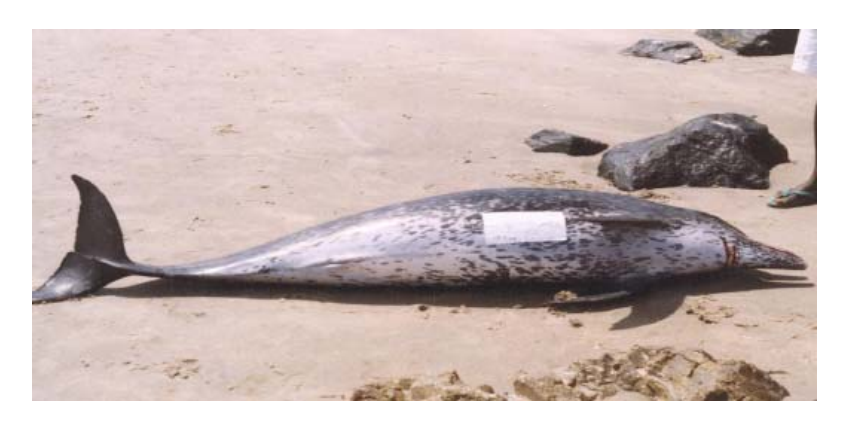
Fig. 6. Atlantic spotted dolphin, Stenella frontalis , offered for sale on Dixcove's landing beach on 3 Jan 2003. Large black spots on a white ventral field and a sturdy, middle-sized rostrum are characteristic.

Earliest documented records. The earliest authenticated report of an Atlantic spotted dolphin in Ghana was a juvenile of 175 cm landed at Dixcove on 19 June 2000. Its skull is curated at UOG (20/01A). A second freshly captured specimen was photographed (Fig. 6) on the Dixcove landing beach on 3 January 2003.