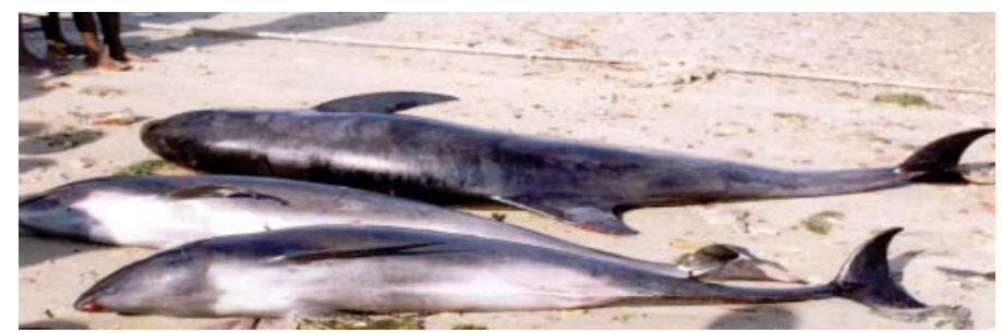
Fig. 10. Three melon-headed whales, Peponocephala electra , landed at Dixcove on 22 Jun 2000. The markedly triangular head-shape (in dorsal view), very pointed flippers, a slender tailstock, an indication of a very short beak (visible in the animal at the forefront) and a higher toothrow count (20–25) distinguishes this species from the pygmy killer whale.

Distribution and natural history. P. electra is known in the Gulf solely from bycatches in Ghana. Geographically, adjacent records are, to the northwest, a skull from Guinea-Bissau (van Bree & Cadenat, 1968) and to the south, three sightings off Angola in deep oceanic waters (Weir, 2007) plus a stranding at Hout Bay (34° 03' S, 18° 21' E), South Africa (Best & Shaughnessy, 1981). Nonetheless, P. electra may be widely distributed in the eastern tropical Atlantic. Length at birth is reported as ca . 1 m (Jefferson & Barros, 1997), but the '122 cm' calf from Shama showed 4–5 vertical creases on its flanks, suggestive of foetal folds as from a recent birth. Uncertainty exists though, whether standard length had been taken or body length had been overestimated, by measuring over the body curvature. The Shama female showed swollen mammary slits consistent with lactation, hence it seemed safe to conclude that a mother/calf pair was involved. Female sexual maturity is reached, on average, at 235 cm (Jefferson & Barros, 1997), but this does not account for possible geographic variation.