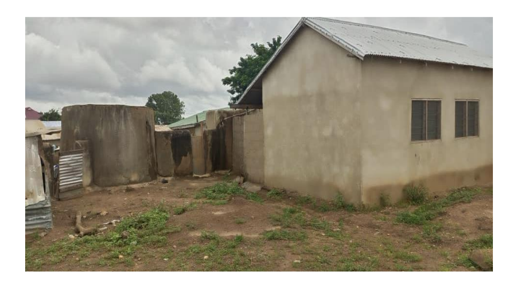
G. A combination of local and modern-style architecture, Gariba (2023)

great achievement. It is the dream of every family."<sup>13</sup> Somehow this perception explains why family heads or parents will periodically remind their sons and daughters in the urban centers and abroad to 'transform' the family house so they can also be seen participating in 'modern life'. Indeed, it is generally perceived that a house not built with cement and roofed with corrugated sheets or at least having a combination of both modern and local architecture is said to be old fashioned. Families and individuals perceive the transformation of the house as expression of great achievement.