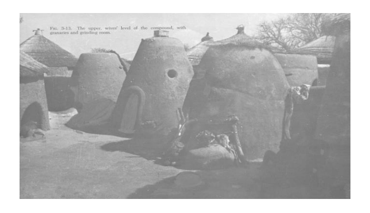
F. Granaries in the courtyard, dabiak, Kroger (2001)

the only one (his eldest son may sometimes do so) who can give permission for grains to be taken out of the granary. In fact, the "granary holds the essence of fatherhood. Through the 'contained' food inside the granary, and the man guarantees the continuity of life and of his lineage" (Cassiman, 2006:167). Thus, the granary constitutes an essential unit of well-being related to the compound's different social meanings and practices of life.