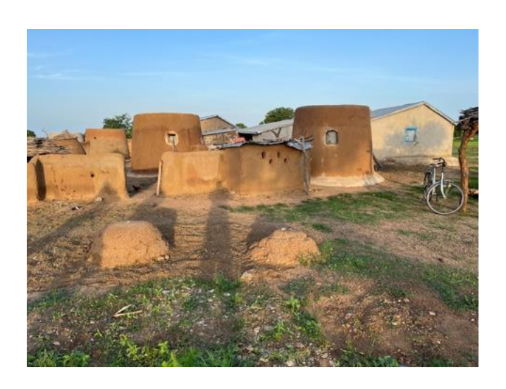
E. Open gate, nansuing of a house, Gariba (2011)

winds and rains from the east (see Drucker-Brown, 2001). At night, the gate is closed to prevent predators from plundering the livestock in the cattle yard. But more importantly, the gateway symbolises economic independence and success from hard work. If the joint family in a compound comprises several separate farming groups, each group will have its own gateway into the compound. Just inside the entrance, one finds a big yard (nankpeing) where cattle and sometimes sheep and goats belonging to each family are kept.