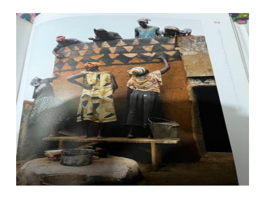
B. The design and smooth finishing of the outer wall of a local house, Cassiman (2011)

boiled from the bark of locust bean pads, dawadawa . During fieldwork, I visited a home under construction and one of the women explained to me: "Cow dung, water and earth are a sign of fertility, spiritual protection, purity, and energy because we believe that cows are a source of energy for nourishment and the earth a source of fertility for both humans and animals. Water denotes life and purity. So, when we mix cow dung, water and earth together, we bring the divine and mundane together in a 'harmonious' relationship."