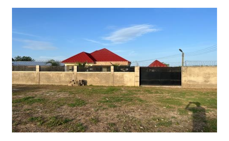
H. A modern-style house in the Bulsa area today, Gariba (2023)