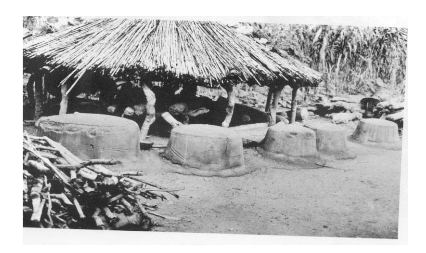
D. Open shed (Kusung) in front of a house and ancestral shrines, Kroger (2001)

When approaching a Bulsa compound, the first structure is an open shed 'Kusung' made with wooden beams resting on short Y shape wooden columns. It is roofed with thatch in a circular fashion. Located in front of the hut of the houses is the ancestral shrines bogluta, showing the number of generations of ancestors in the existence of a lineage. The picture below shows five ancestral shrines indicating that the ancestor with the biggest shrine bogluk lived five generations ago, and the present head of the homestead, Yeri Nyono, is the eldest of that ancestor's descendants.