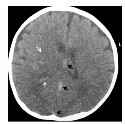
Figure 1: Non-enhanced head computed tomography (CT) showing linear hyperdense cord sign involving the deep venous system (black arrows), hemorrhages and hypodense (white arrows) right thalamus, and basal ganglia

Correspondence to: Dr. Binit Sureka, Vardhman Mahavir Medical College and Safdarjung Hospital, Resident Doctors Hostel, Room-57, New Delhi - 110 029, India. E-mail: binitsurekapgi@gmail.com