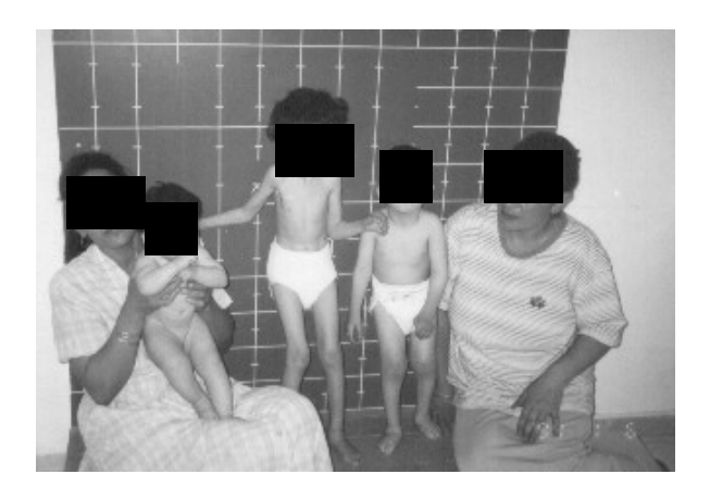
Figure 2: The Family [From the right to the left; III 3 is the mother of the proband, next the proband (IV 2). Next, the female cousin, with the full clinical criteria of Cockayne syndrome, (IV 3), Next the female offspring IV 4 with clinical features mimicking COFS syndrome]