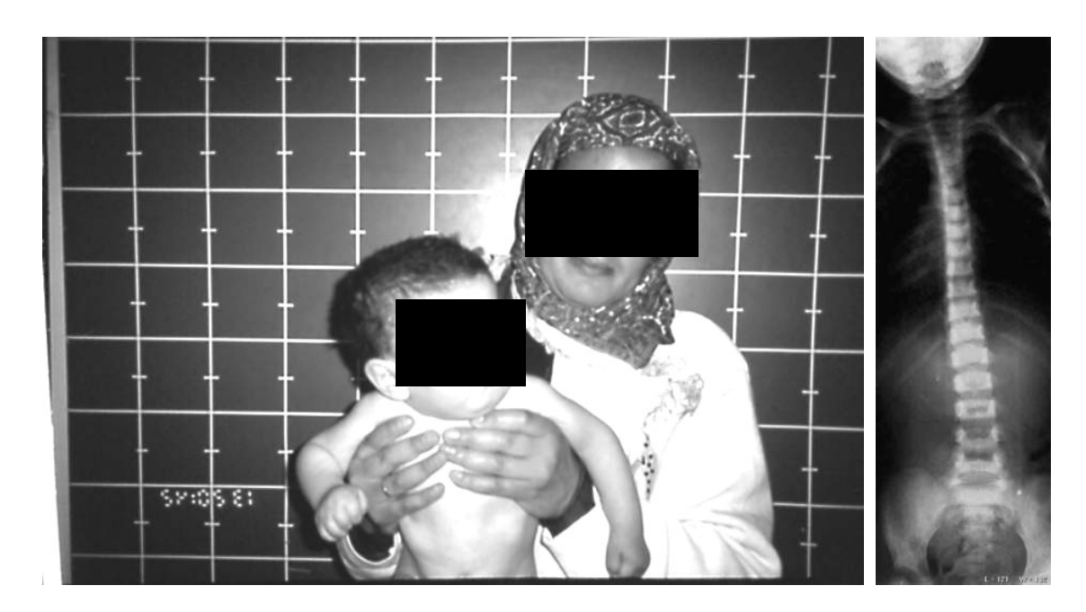
Figure 3: The proband and his mother (IV 2) and (III 3); antero-posterior X-ray view (note the osteosclerotic bone changes in a descending manner and discrete dorsal scoliosis)