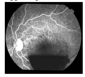
Figure 2a. Slow venous return

The biological assessment performed by her obstetrician had found a normal platelet rate, there was no blood-clotting trouble. Fluorescein angiography (FGA) performed two months later showed no leakage. A slower venous return to the arteriovenous time especially on the lower temporal vein, facing the bud (Figure 2a). Latetime dilatation of the same vein (Figure 2b) suggesting a venous lesion.