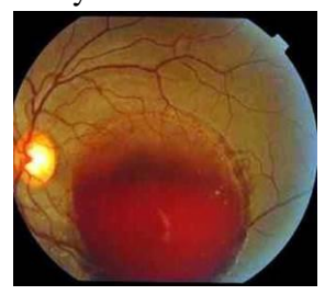
Figure 3a. Regression of hemorrhage at 1 month

was a complete anatomical and functional restoration, with a visual acuity of 10/10 in the left eye.