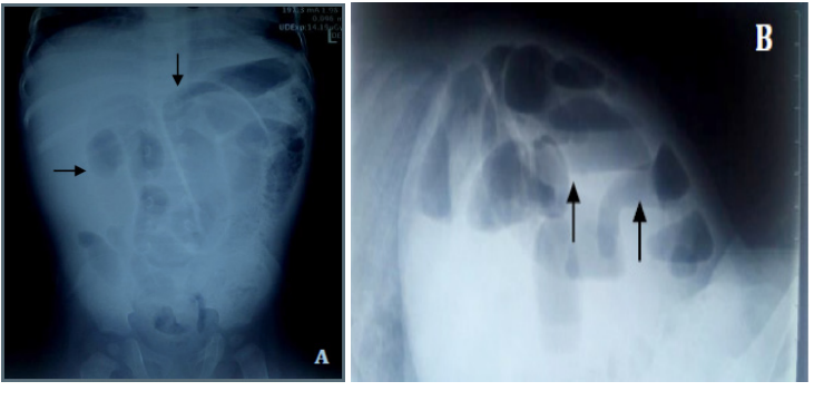
Figure 1. Preoperative plain radiographs. A) supine view showing dilated bowel loops with increased bowel wall attenuation; B) Dorsal decubitus view showing dilated bowel loops with multiple air fluid levels.

A 7-month-old male was admitted to the pediatric surgical unit at Kenyatta National Hospital with a 1-day history of abdominal pain, fever and vomiting. The abdominal pain was colicky and intermittent; the vomiting was non-bilious and postprandial. There was no history of constipation and the child was passing stool and flatus. He was clinically febrile with a temperature of 40°C. He had a mildly distended abdomen which was mildly tender, no abdominal masses were palpated and bowel sounds were present. Mucoid soft faeces were noted on digital rectal examination with no rectal masses palpated. The WBC count was 11.2×10<sup>9</sup>/L with a neutrophil count of 5.42 \times 10^3 /µL. An initial abdominal x-ray showed dilated bowel loops, predominantly small bowel with increased bowel wall attenuation (Fig. 1). An abdominal ultrasound was reported with no features of intussusception or free intraperitoneal fluid but was inconclusive of a diagnosis.