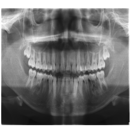
Figure 2. Immediate postoperative radiograph of transplanted tooth.

The overall 3-year survival rate of autotransplanted mandibular molars in this study was 75%, with two cases of failure of treatment (25%) occurring 6 months following the surgical procedure. Also, 100% of transplant teeth with root developmental stages greater than half with open apices survived while 50% of teeth with their roots just half formed survived (Fig. 5); although, this was not statistically significant (p>0.05). The association between demographic factors (age, sex) and survival of transplant teeth was not statistically significant.