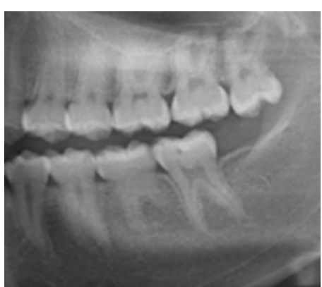
Figure 3. 3-year postoperative radiograph of the same patient in Figure 3.