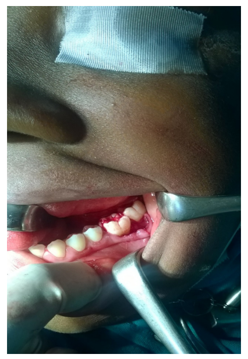
Figure 1. Immediate postoperative photograph of transplanted tooth 36 under local anaesthesia in a 14-year-old adolescent.

Preparation of the recipient bed included extracting the grossly carious tooth, curetting the root socket to remove any pathologic lining, and removing interradicular bone to create adequate space for the transplanted tooth. Bone was removed and curetted using a surgical drill, which resulted in increased mesio-distal width as well as the apico-coronal length. The donor tooth with its complete root sheath was then carefully placed in the prepared recipient bed. The operators ensured that the donor teeth were placed in infra-occlusion to prevent trauma from opposing teeth and allow for spontaneous eruption.