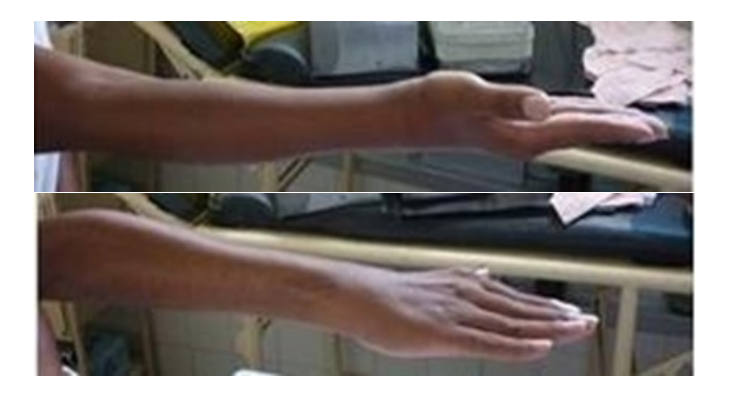
Figure 6: Clinical evaluation at 6 months postoperative with disappearance of edema, pronosupination and grip strength of the right hand.