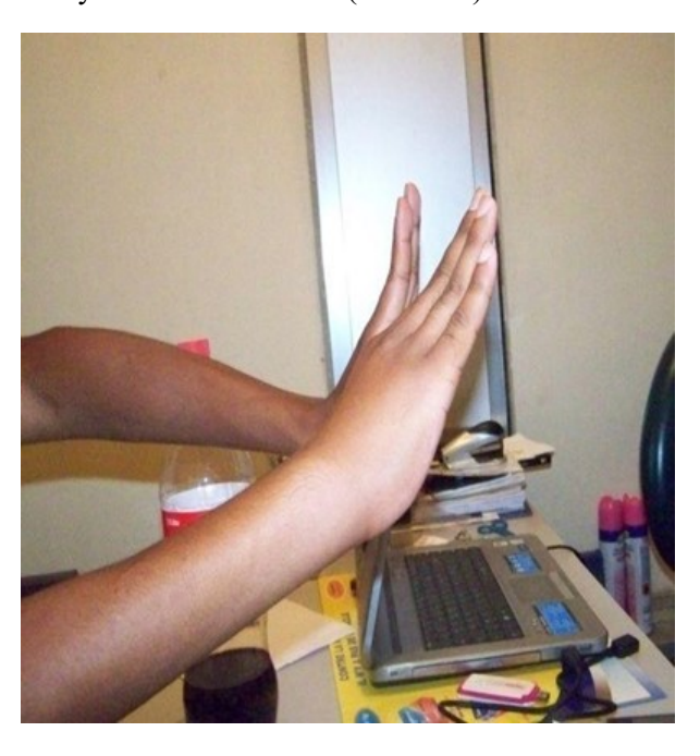
Figure 3: Functional impairment of the right wrist associated with circumferential edema.

The operative sequence was uncomplicated. Rehabilitation started at the sixth week after removal of the cast. At 6 months of follow-up, pronosupination was comparable to that of the healthy side with pseudarthrodesis stabilized (Figs. 5,6). The postoperative Cooney wrist score was 90 (excellent).