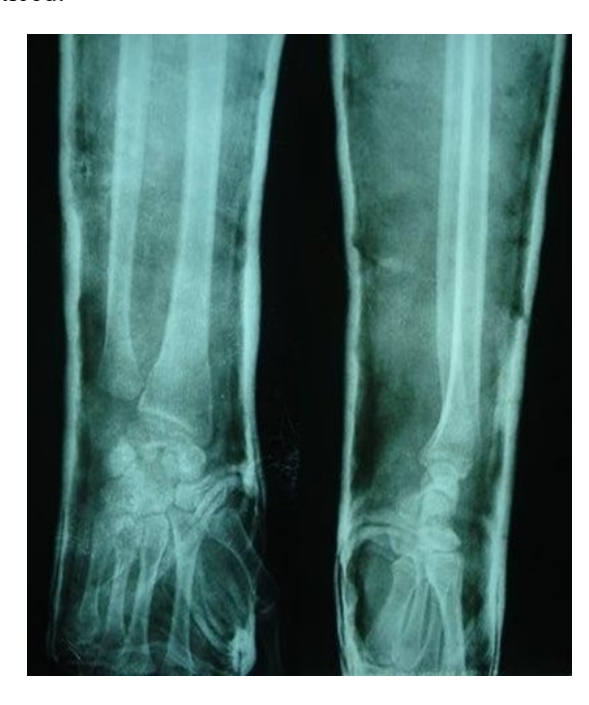
Figure 2: Control radiograph centered on the left wrist in front and lateral incidence after the reduction of dislocation

A closed reduction under general anesthesia was performed followed by a brachio-antebrachio-palmar cast in neutral position for 3 weeks (Fig. 2). The elbow was released on the third week and the wrist joint was kept immobilized for three additional weeks. After 2 weeks of rehabilitation, she resumed her daily activities without difficulty. After 2 years, no recurrence of luxation was noticed.