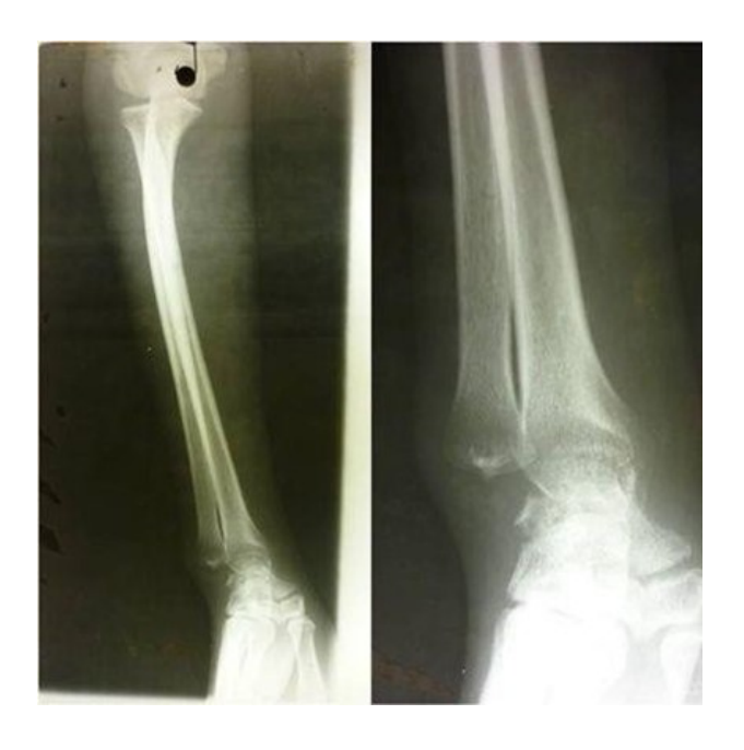
Figure 4: X-ray of the right wrist in profile incidence showing neglected dorsal dislocation of the DRU