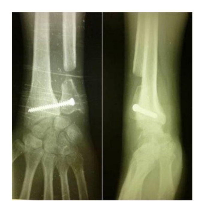
Figure 5: Right-hand wrist control x-ray in frontal and lateral incidence at 6 months of recoil showing stabilization of the pseudarthrodesis and early fusion of the DRU.