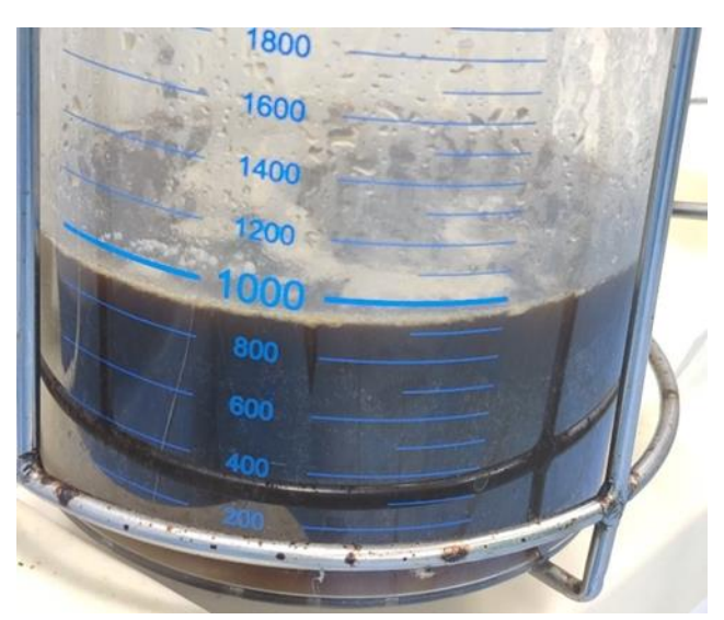
Figure 3B. Content of the cyst showing sticky, brownish-yellow chylous fluid.

The surgery did not necessitate bowel resection, and the rest of the abdominal viscera was normal. The post-operative course was uneventful, and she was discharged on the 7th post-operative day. The histopathology report was consistent with chylolymphatic mesenteric cyst.