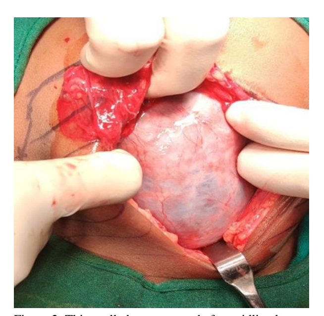
Figure 2. Thin-walled cyst exposed after midline laparotomy

The diagnosis was consistent with mesenteric cyst. An exploratory laparotomy was planned by a midline incision (Figure 2).