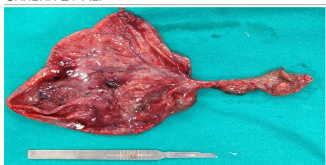
Figure 3C. Excised specimen of Mesenteric cyst