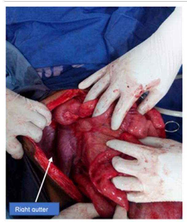
Figure 3. Cecum and ascending colon not fixed in the right gutter.