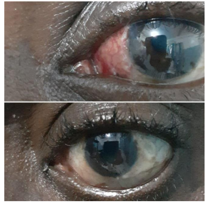
Figure 2. Photograph of the left eye post-pterygium excision+conjunctival autograft. (top) Post-operative week 2. (bottom) Post-operative week 6.

Two weeks after surgery (see appearance of the eye in Figure 2), all patients were reviewed again, and slit-lamp examination, presenting visual acuity testing using the Snellen's chart at 6 m, and recording of complications, if present, were done.