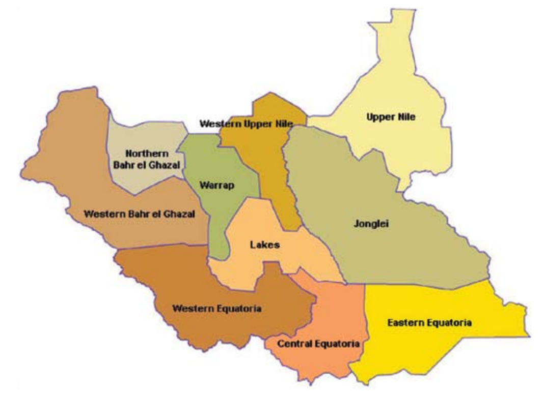
Figure 1: Southern Sudan States

data and region of origin, information about duration of symptoms, findings on physical examination, treatment regimens and complications were documented.