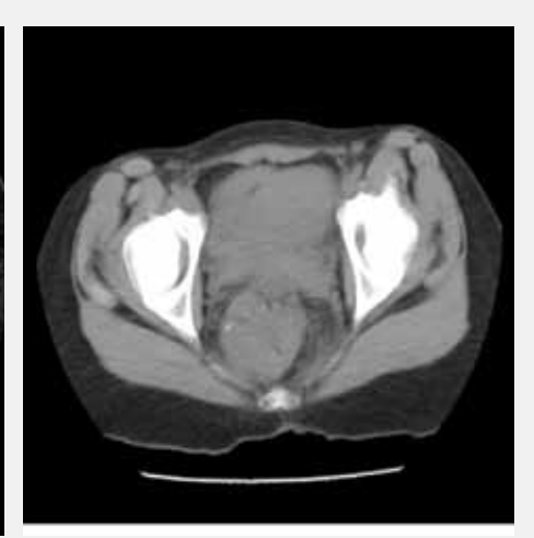
Fig 2: CT scan images of the patient shows thickening of the rectal wall with narrowing of the lumen filled with water contrast (a). Tortuous blood vessels representing serpentine enlarged blood vessels in the distal rectum(b), and characteristic calcifications in the rectal wall (c).