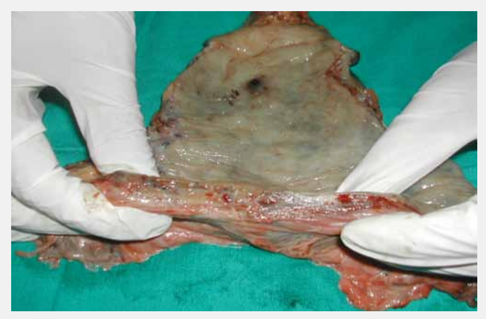
Fig 3: Surgical pathology specimen from the patient confirming the diagnosis of diffuse cavernous haemangioma involving the rectum with marked, focal submucosal haemorrhage and multiple organizing thrombi involving the submucosa, serosa, and mesenteric fat.